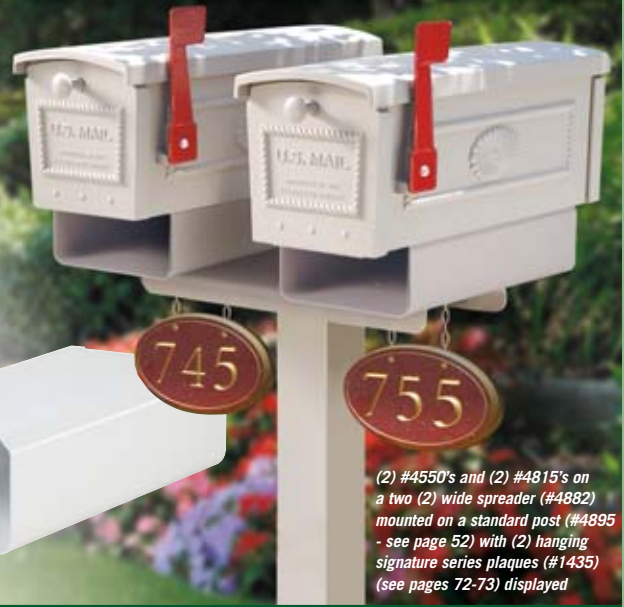
(2) #4550's and (2) #4815's on a two (2) wide spreader (#4882) mounted on a standard post (#4895 - see page 52) with (2) hanging signature series plaques (#1435) (see pages 72-73) displayed