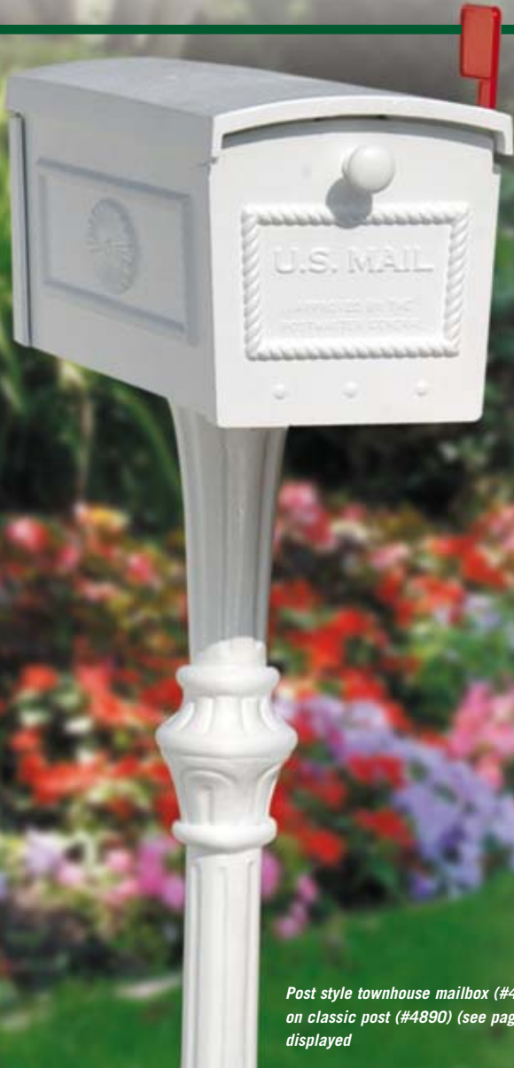
Post style townhouse mailbox (#4550) on classic post (#4890) (see page 53) displayed