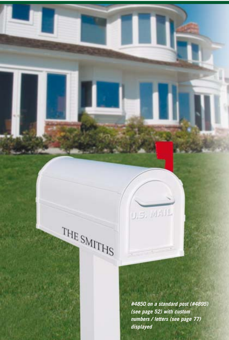
#4850 on a standard post (#4895) (see page 52) with custom numbers / letters (see page 77) displayed