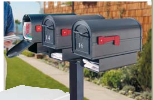
(3) #4850's and (3) #4815's on 3 wide spreader (#4883) mounted on a standard post (#4895) (see page 52) with custom numbers / letters (see page 77) displayed