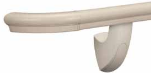
3 bracket styles