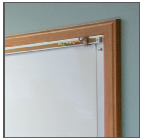
Accent Trim Pieces