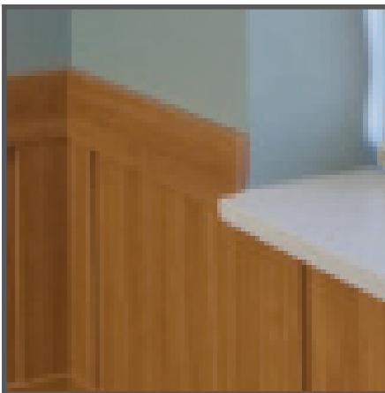
Factory Finished Beveled Edge