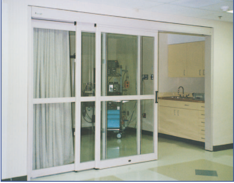
3-Panel ICU Telescopic Package

Besam manual ICU/CCU sliding doors are available with an optional lock that will latch the active leaf in place when closed. A lever handle is provided on each side of the active leaf door to unlock the sliding door.