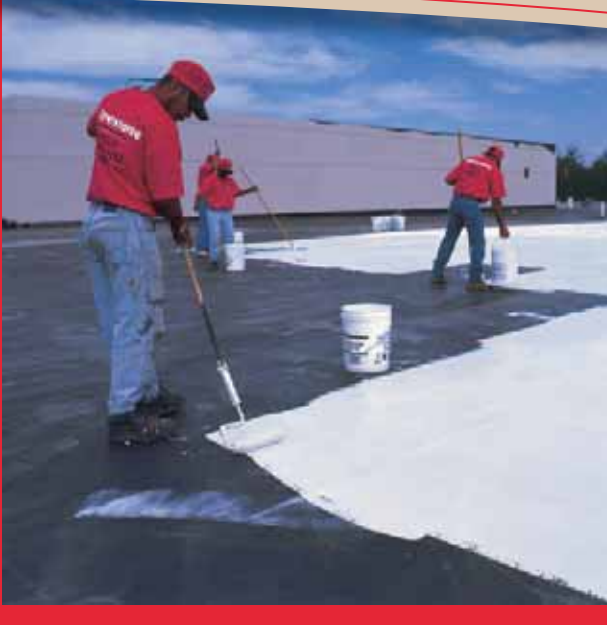
Firestone's Acryli Top™ coating helps extend an EPDM roof's service life.

Not only does the application of AcryliTop coating extend the life of the roof, it also offers various levels of reflectivity. Firestone White AcryliTop coating is designed to reflect at least 68% of the sun's energy after three years – 30% higher than the EPA's ENERGY STAR® Standard. AcryliTop can be applied at anytime to extend the life of the roof or simply to renew aesthetics.