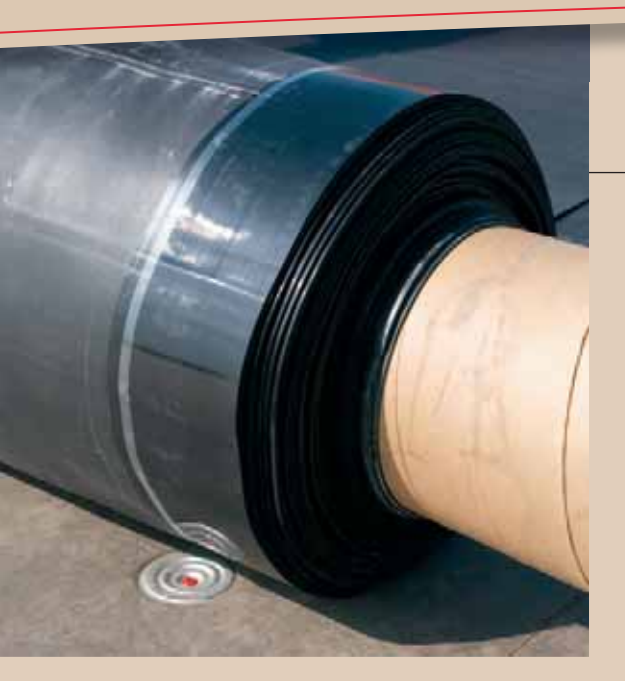
RubberGard Pre-Applied Tape (PT) Products deliver uniform Factory Applied Seams for faster installation and improved performance.