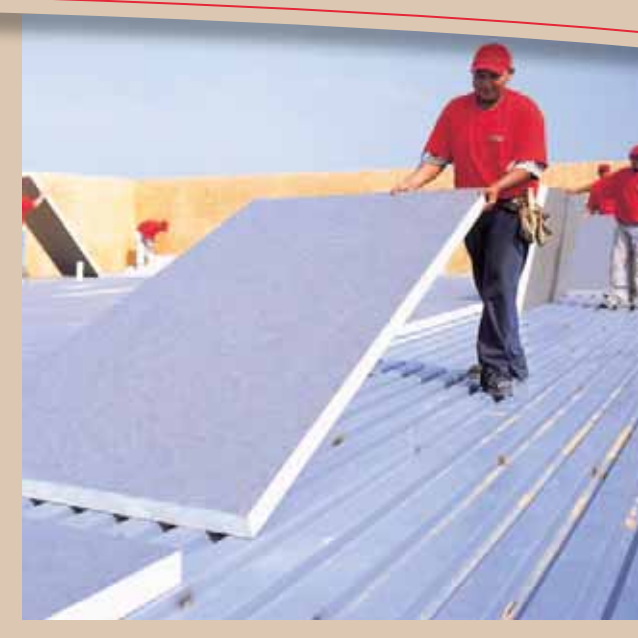
Firestone ISO 95+* polyiso insulation has the highest R-value ratings per inch versus other insulating materials. ISO 95+ insulation is compatible with numerous substrates, including steel, structural concrete, gypsum, tectum and wood decking.