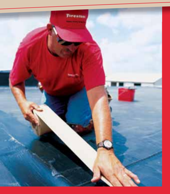
The Firestone QuickSeam Tape Seam System is the most advanced method of field seaming RubberGard EPDM membrane available in the industry.

Firestone EPDM Roofing: Strength plus durability equals performance.