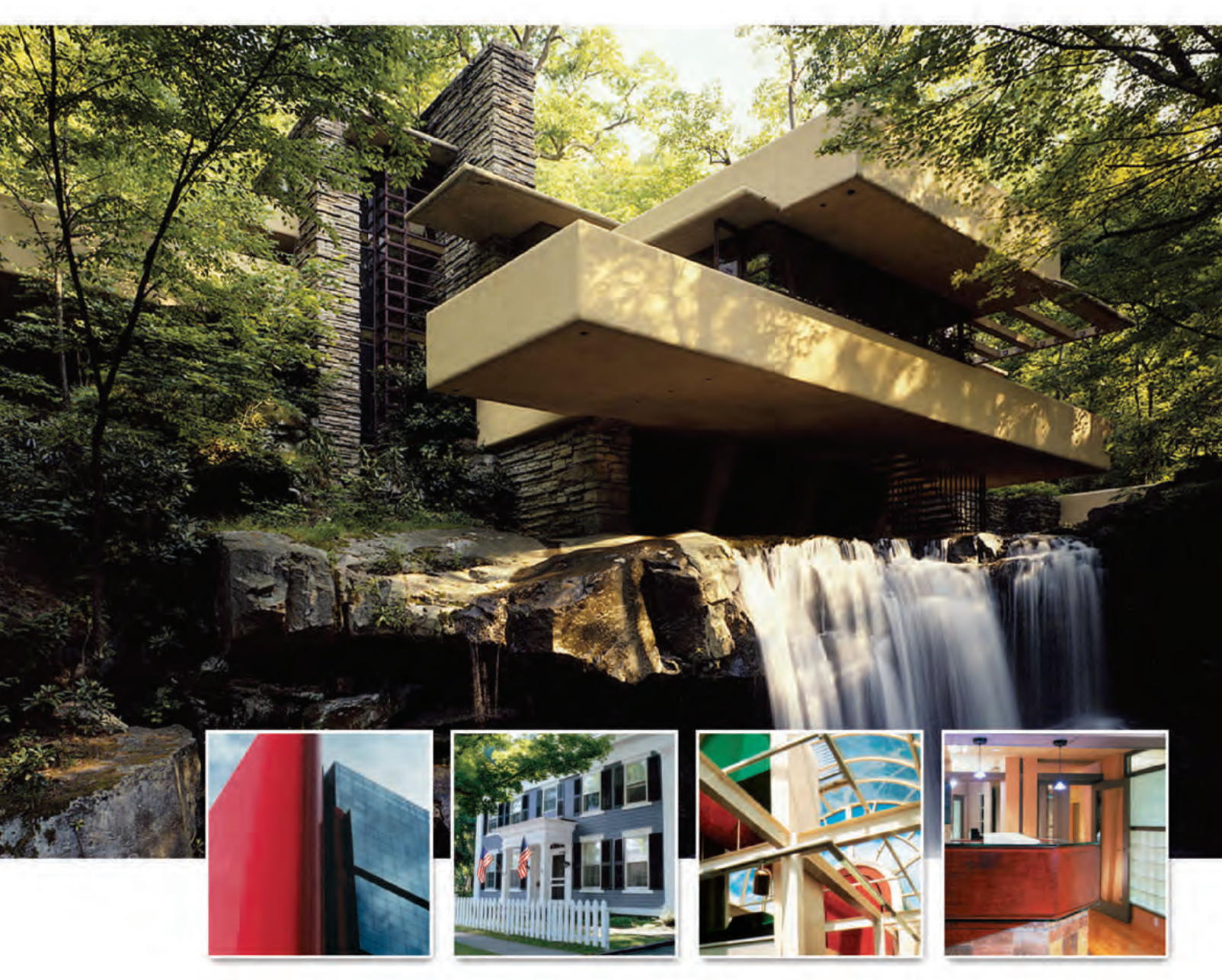
It's all about performance.