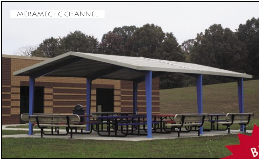
MERAMEC · C CHANNEL