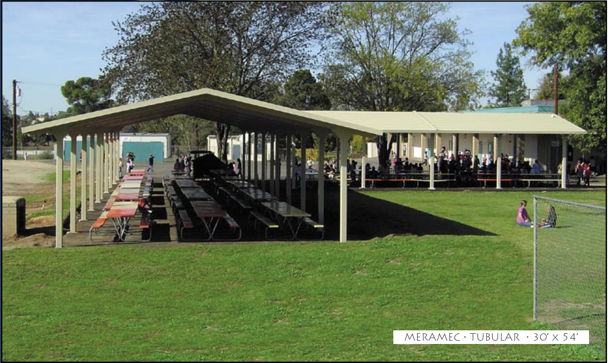
MERAMEC · TUBULAR · 30' X 54'