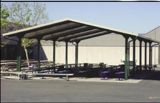
MERAMEC · 30' X 54' · DE PORTOLA CA