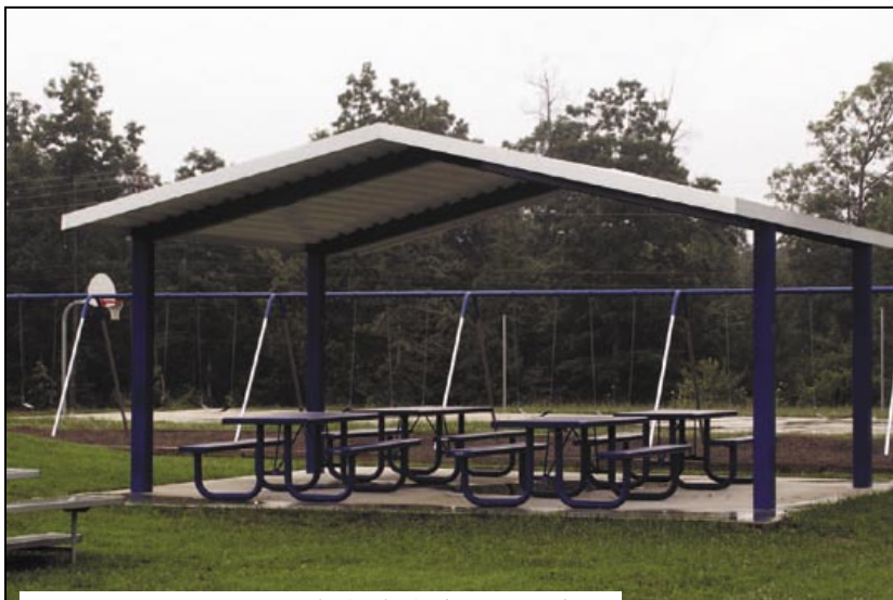
MERAMEC · TUBULAR · 20' x 20' · ALLARDT TN

ROOF PANELS RUN HORIZONTAL AND SERVE AS SUPPORT.