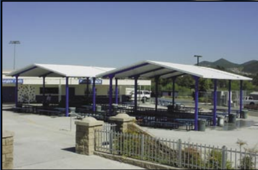
MERAMEC · 30' X 42' · SAN MARCUS CA