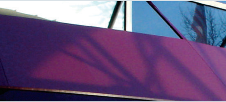
1. Ferrari Précontraint® 502 Fabric Canopy