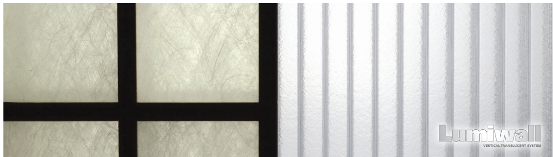
Fiberglass sandwich panel photographed side-by-side with a Wasco 40mm multiwall polycarbonate panel.