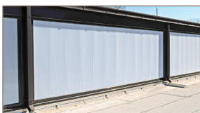
Wasco's LumiWall 40mm Multiwall Polycarbonate System

The fiberglass facers have a coating for UV protection, which is subject to weathering away resulting in color change. The absence of the coating will cause the fiberglass to "fiberbloom". This is common with older panels and leads to additional discoloration with the added retention of dirt. The fiberglass warranty calls for on-going UV maintenance by reapplying coatings.