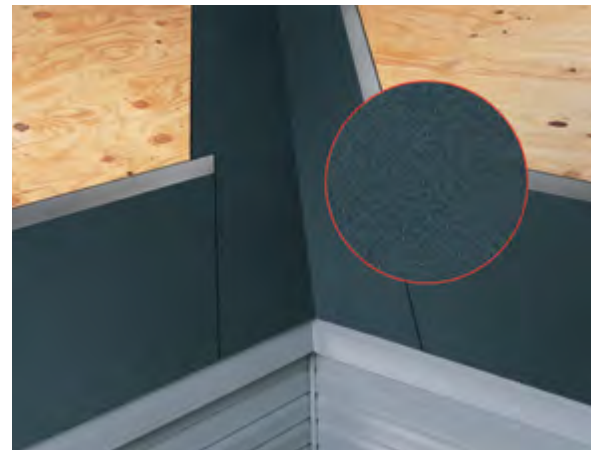
WeatherLock® G Granulated Self-Sealing Ice & Water Barrier