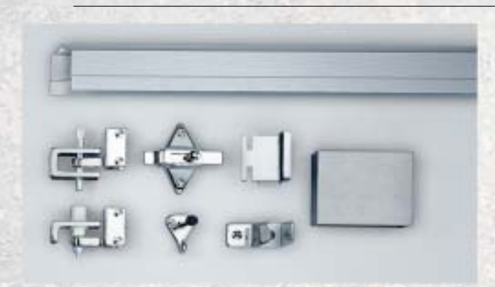
STANDARD THROUGH-BOLTED ZAMAK HARDWARE Series: 1540; Stainless Steel Option