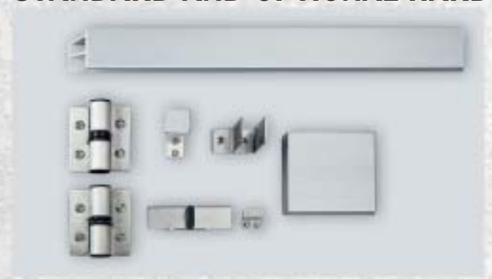
STANDARD CONCEALED STAINLESS STEEL HARDWARE Series: 1090 (3 Hinges, 2 Door Stops), 1080/1180 (3 Hinges), 1040, 1030