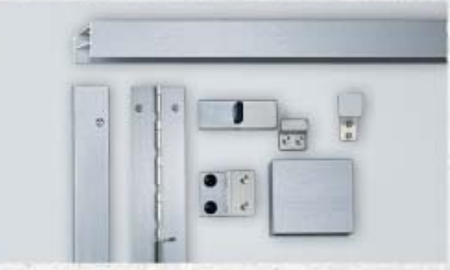
OPTIONAL FULL-HEIGHT STAINLESS STEEL HARDWARE Series: 1090, 1080/1180, 1040, 1030