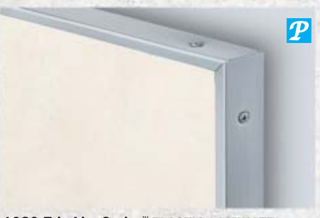
1030 TrimLineSeries™ PLASTIC LAMINATE