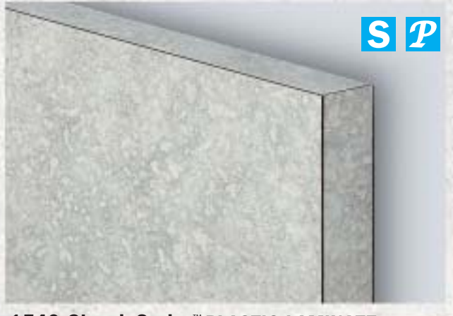
1540 ClassicSeries™ PLASTIC LAMINATE 1040 DesignerSeries™ PLASTIC LAMINATE