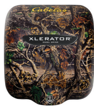
XL-SI** Custom Special Image