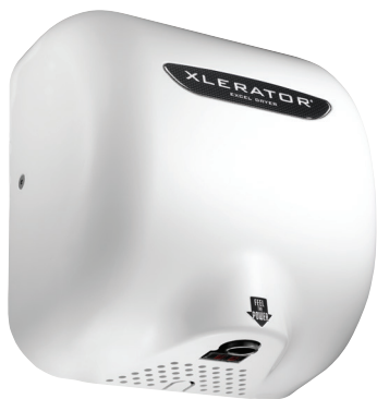
XL-BW White Thermoset Resin (BMC)

MODELS: XL - BW W GR C SB SI SP OPTIONS: -1.1N (Noise Reduction Nozzle) -H (HEPA Filter) -VOLTAGE (See Chart)