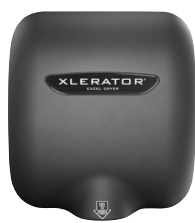
XL-GR Graphite Textured Painted