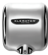
XL-C Chrome Plated