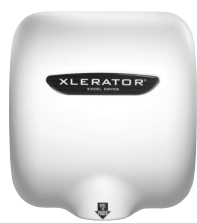
XL-W White Epoxy Painted