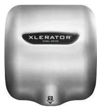
XL-SB Brushed Stainless Steel