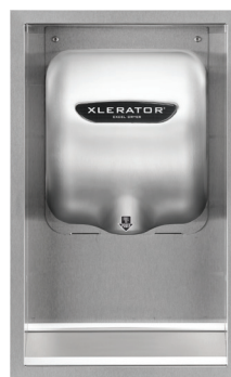
Part # 40502