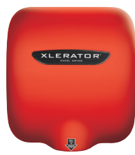
XL-SP*** Custom Special Paint