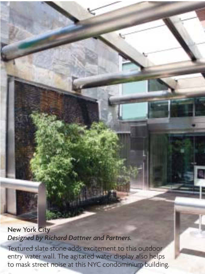
New York City Designed by Richard Dattner and Partners. Textured slate stone adds excitement to this outdoor entry water wall. The agitated water display also helps to mask street noise at this NYC condominium building.