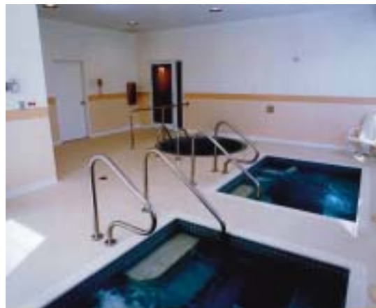
The Oasis Resort and Spa, Gulfport, MS