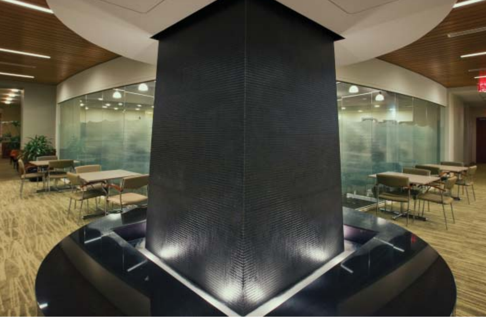
Above: Corporate Headquarters. Greenwich, CT