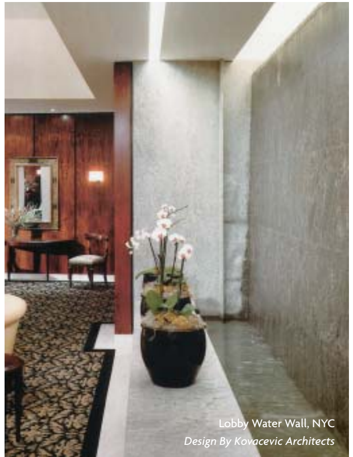
Lobby Water Wall, NYC Design By Kovacevic Architects