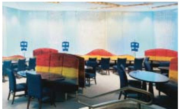
Gourmet Restaurant at Mohegan Sun, Uncasville, CT