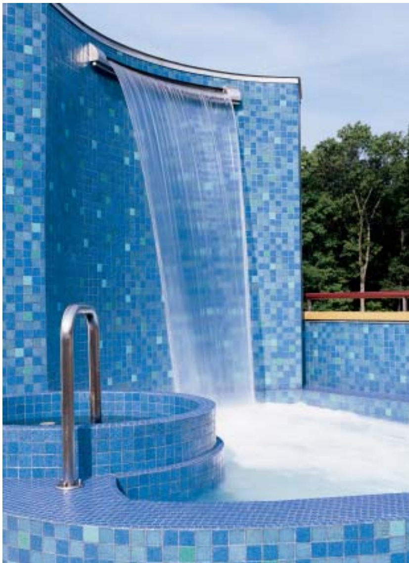
Waterfall spa with cold pool Design by Watermulder-Andrews Architect

For over seventeen years, Water Structures has provided distinctive tile and natural stone spas to hotels, casinos, professional sports teams and residences throughout the USA.