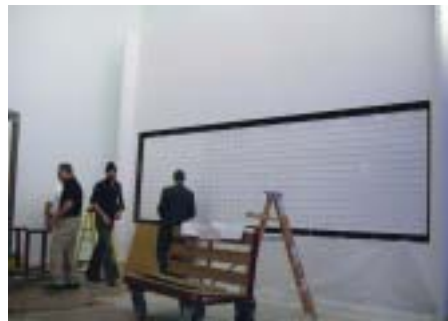
Left: Factory crew installing Hackensack Children's Hospital Water wall.