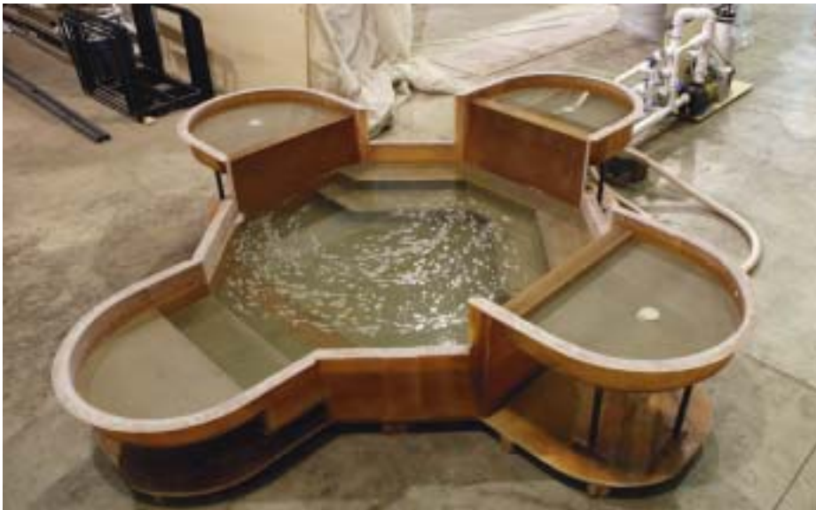
Below Left: Diagnostic factory test of a custom water feature with built-in equipment pack.