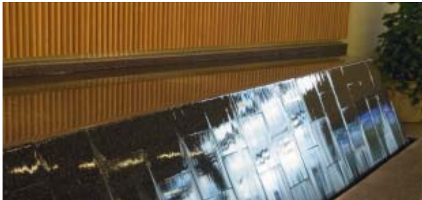
TOP: Water Wall Courtyard Greenwich, CT