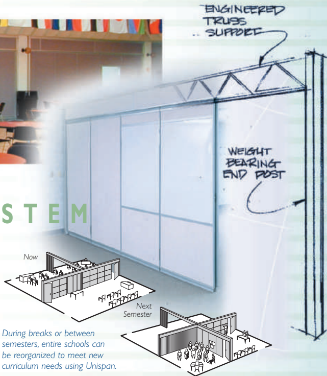
During breaks or between semesters, entire schools can be reorganized to meet new curriculum needs using Unispan.

Unispan is ideal for buildings with inadequate overhead support. It consists of a horizontal truss and two support posts that support a partition independent of the building. Unispan is an excellent choice for schools or commercial buildings to accommodate changing tenant needs.