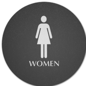
12" Diameter Circle = Women's