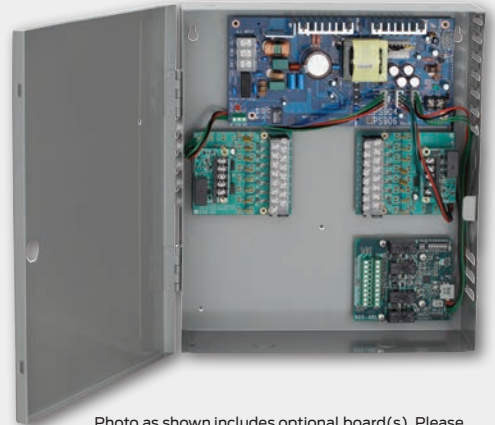
Photo as shown includes optional board(s). Please contact your local sales office or visit the support section on our website for configuration assistance.