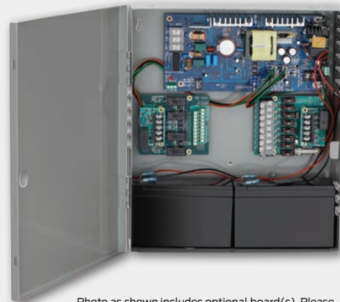
Photo as shown includes optional board(s). Please contact your local sales office or visit the support section on our website for configuration assistance.