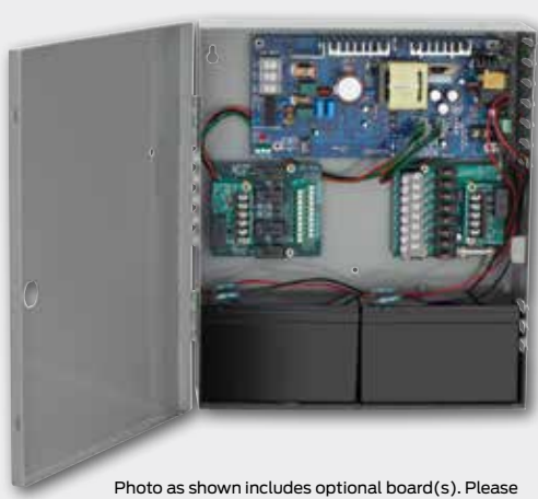
Photo as shown includes optional board(s). Please contact your local sales office or visit the support section on our website for configuration assistance.