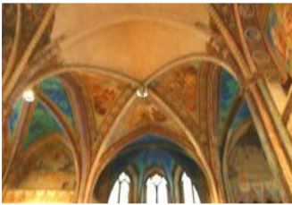
Composite fiberglass repairs to earthquake damage

One of most famous earthquake structural repairs done with composite fiberglass technology was on the vaults supporting the ceiling and frescos at the Basilica of St. Francis of Assisi in Italy.