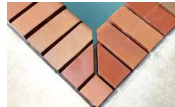
Custom Cut Coping