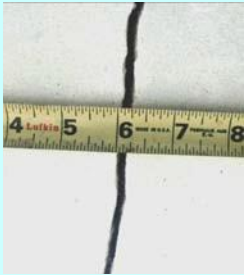
1/4" concrete crack

Structure cracks are ugly and expensive. Water and chemicals must be continually replaced. In addition, if not permanently repaired, cracks allow chemically treated water to reach the reinforcing steel within your pool shell. Such water intrusion causes degradation in the integrity of the pool structure and freeze / thaw damage of the concrete.