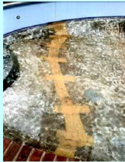
Crack repair with Kevlar® by Dupont and special resins

The INTER-GLASS® crack repair system incorporates biaxial, multi-axial and Kevlar® by Dupont fabrics with special penetrating resins to repair and seal structure cracks. The Kevlar® by Dupont fabrics withstand over 400,000 PSI (pounds per square inch).