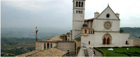
Basilica of St. Francis of Assisi, Italy