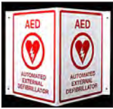
150 V-Shaped Sign - seen from all directions - 8" x 10" AED sign on both sides