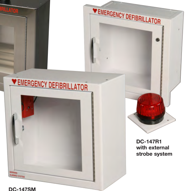
DC-147R1 with external strobe system