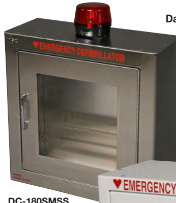
DC-180SMSS with key shut off and strobe