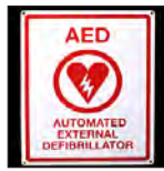
151 Flat Sign - hang above AED - 8" x 10" AED sign