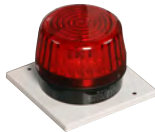
Alarm Cabinet Strobe