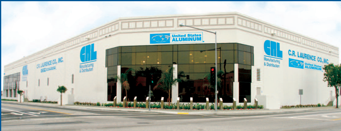
The New U.S. Aluminum Facility in Los Angeles, California