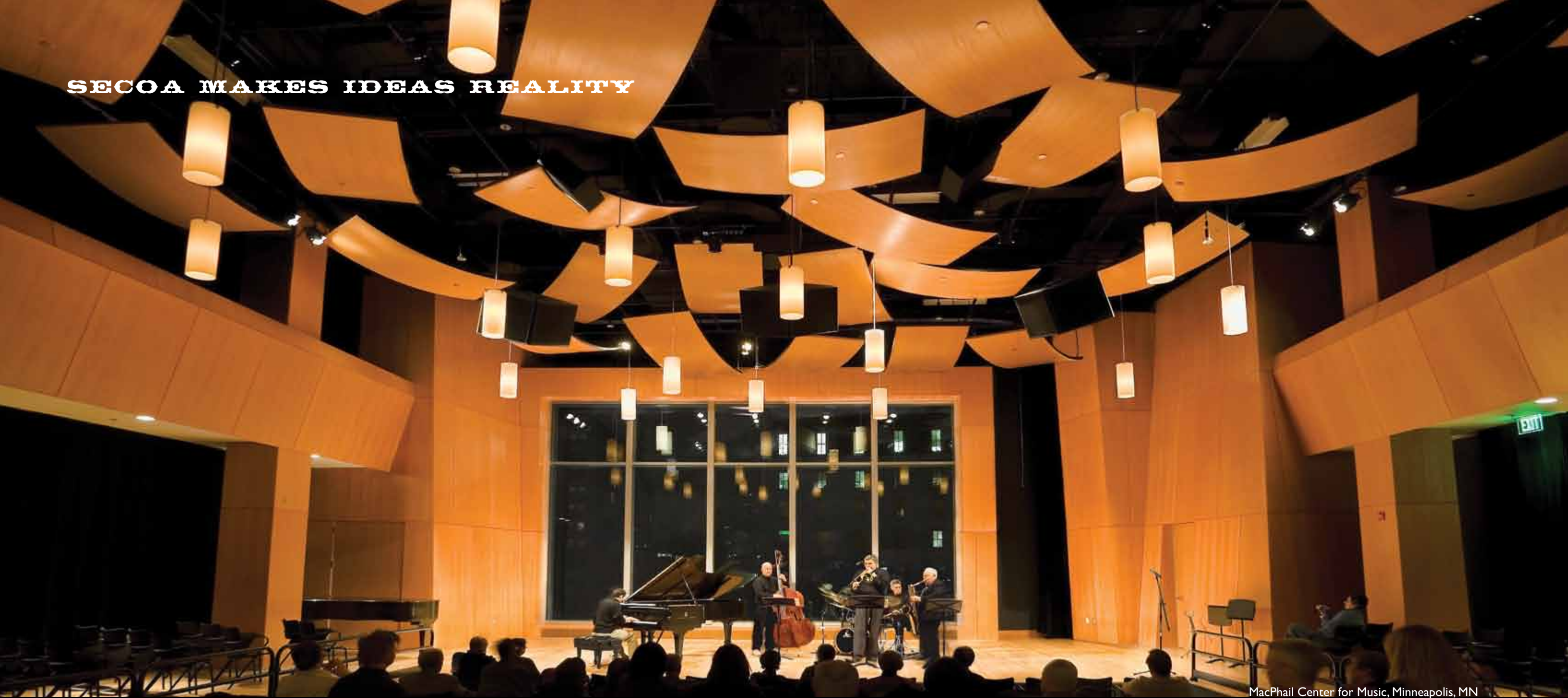
MacPhail Center for Music, Minneapolis, MN