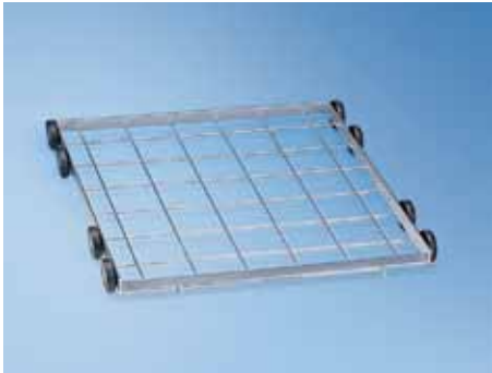
U 874/1 Lower Basket