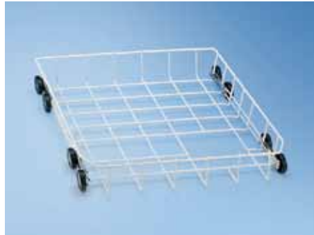
U 880 Lower Basket