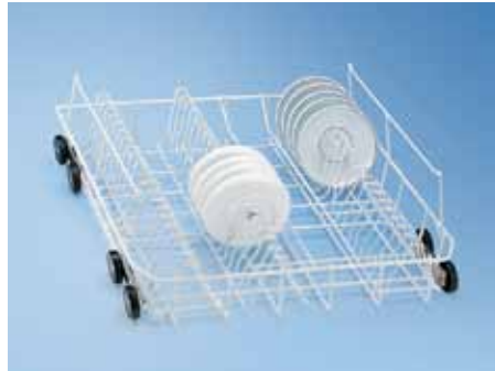
U 881 Lower Basket