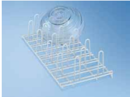
E 9 Upper/Lower Half Insert