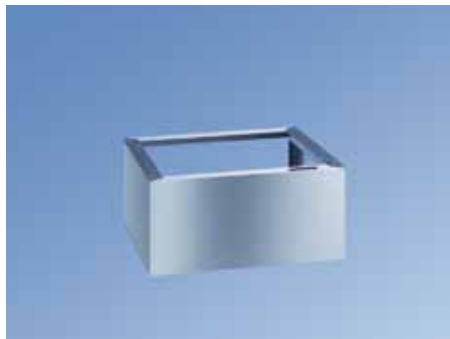
UG 30-60 SS Stand