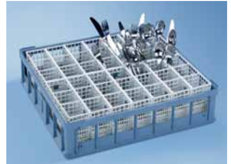
U 304/1 Lower Basket