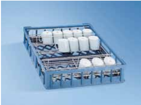
U 306/1 Lower Basket