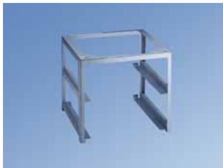
UO 52-60 Tall SS Stand