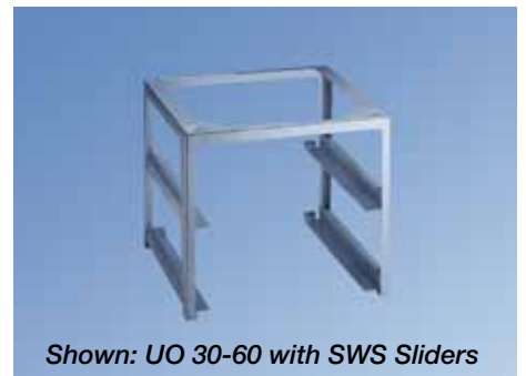
SWS Angled Sliders