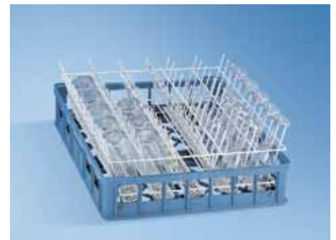
U 318/1 Lower Basket