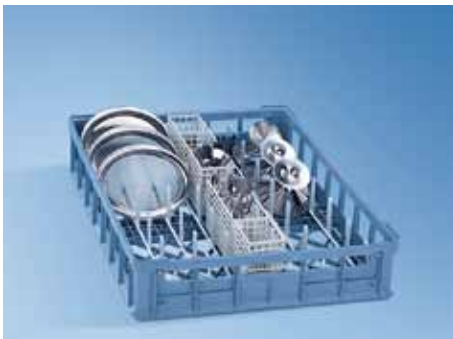
U 307/1 Lower Basket