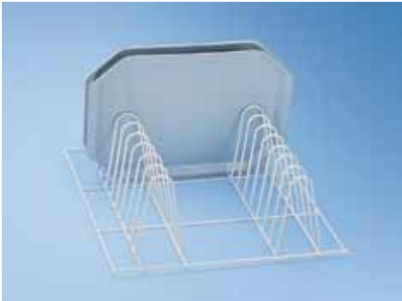
E 884 Lower Full Insert