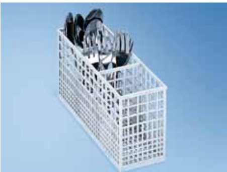
E 165 Lower Insert