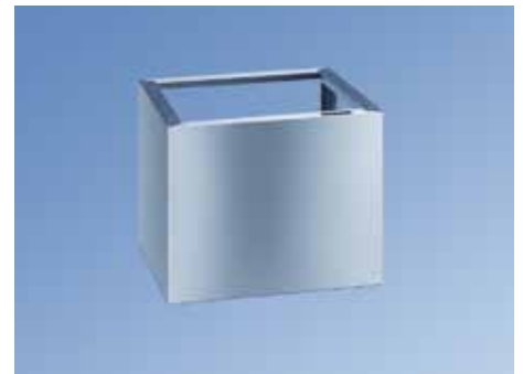
UG 52-60 Tall SS Stand