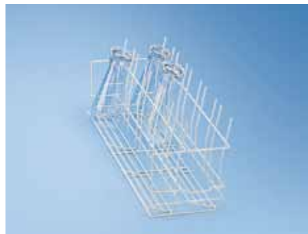
E 815 Lower Half Insert