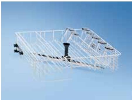
O 889 Upper Basket