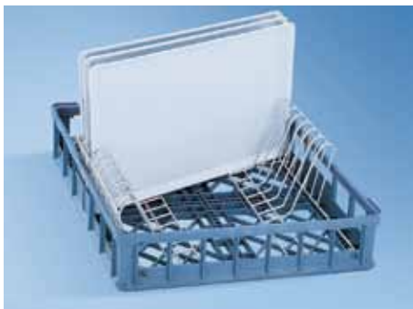
U 313 Lower Basket