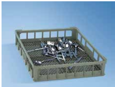
U 303/1 Lower Basket