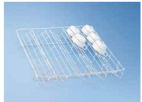
E 809 Lower Full Insert