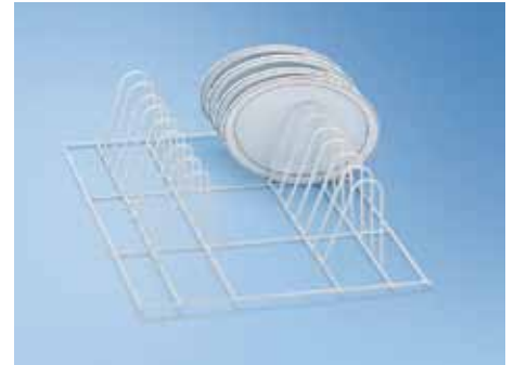
E 888 Lower Full Insert