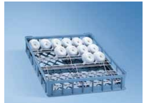
U 301/1 Lower Basket