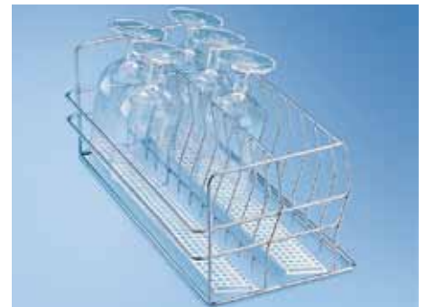
E 459 Upper/Lower Half Insert