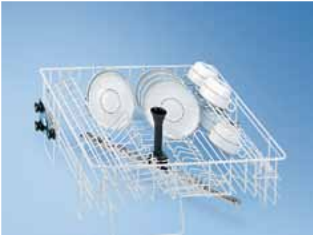
U 881 Upper Basket