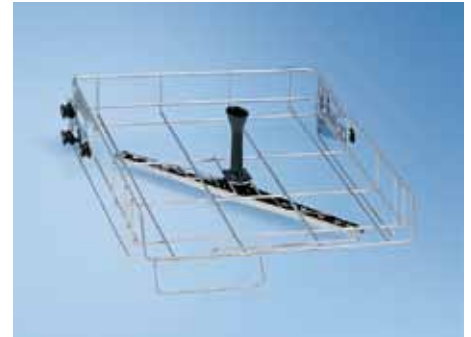
O 882 Upper Basket