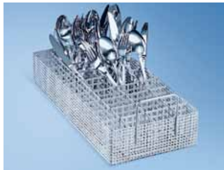
E 437 Upper/Lower Half Insert