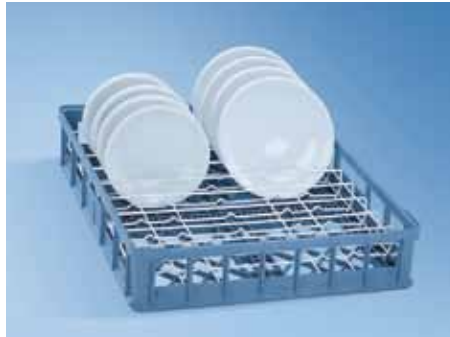
U 300/1 Lower Basket