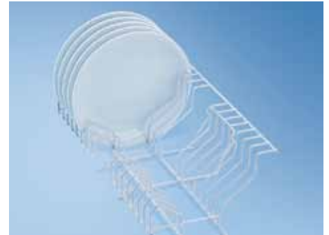
E 216 Lower Half Insert