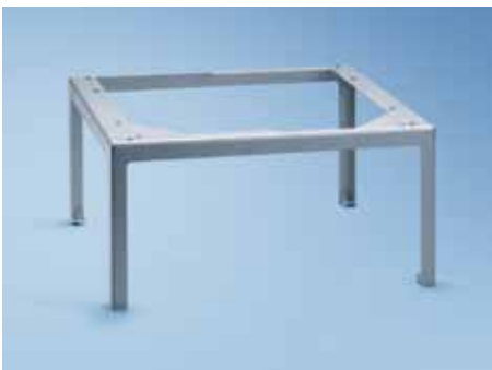
UO 30-60 SS Stand