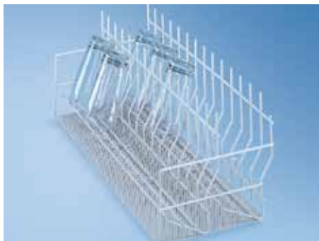
E 205 Lower Half Insert