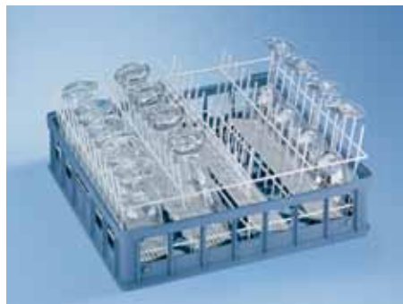
U 317/1 Lower Basket