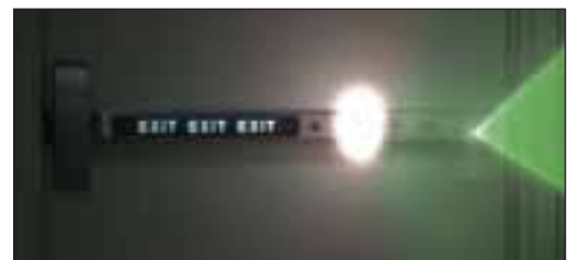
Beacon combines audible and visible alerts for making exit locations highly noticeable in an emergency.

Retrofit kits are available to easily upgrade an existing electrified opening with Beacon.