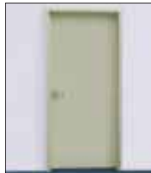
3. Go! Complete doorway installation is done in under 10 minutes!

For more info, visit www.readysetsystem.com