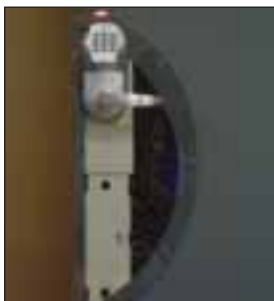
Hidden electronics provide added security and enhanced aesthetics (cutway shown)