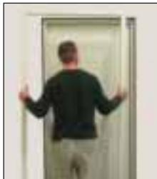
2. Set. Frame trim piece is attached to opening and secured in place through the silencer holes – no exposed fasteners