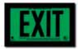
PL exit signs placed low on the door make exits easy to see in smoky conditions. Shown under normal conditions (left) and fully charged in darkness (right).