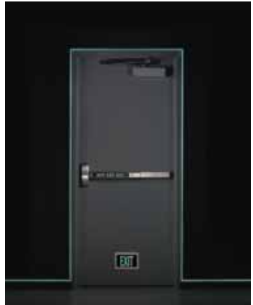
LiteGuide EL brightly illuminates the frame, exit hardware and door, making the means of egress easy to find in an emergency