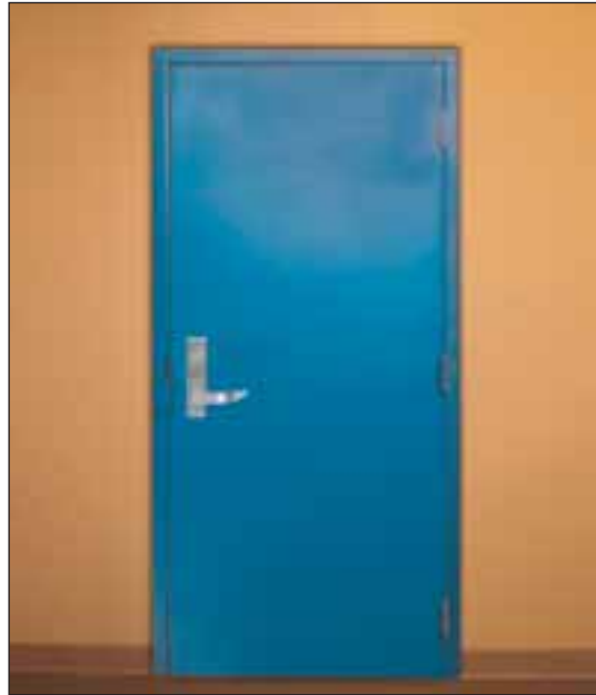
Industry First! Our FEMA 361 and 320 compliant assembly exceeds standards for external and internal safe rooms.

See the Windstorm demo at www.assaabloydss.com