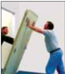
1. Ready. Fully assembled door, hardware and frame unit is removed from pallet and installed in the opening