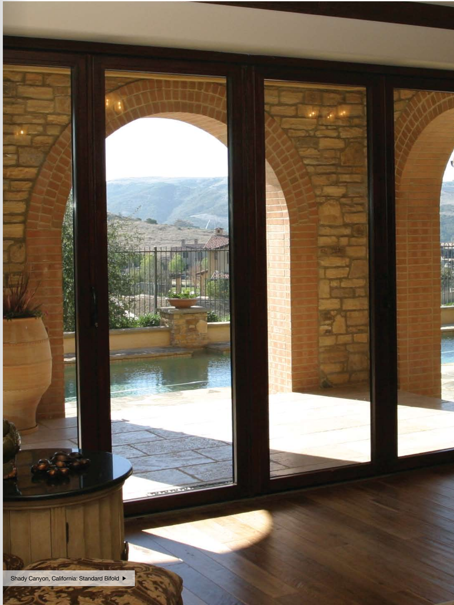
Shady Canyon, California: Standard Bifold ▶