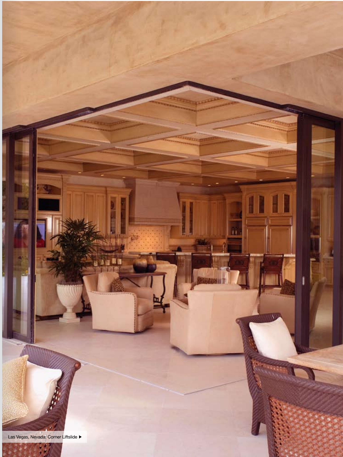
Las Vegas, Nevada: Corner Liftslide ▶