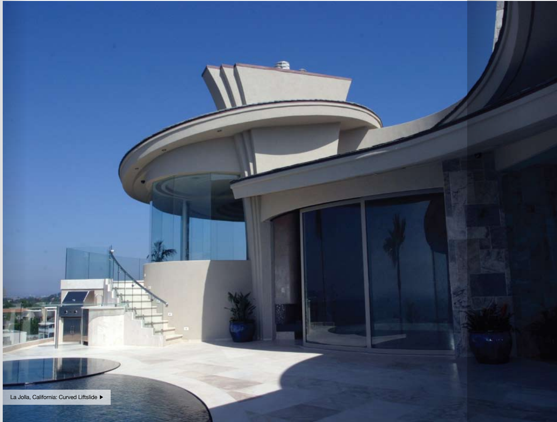
La Jolla, California: Curved Liftslide ▶