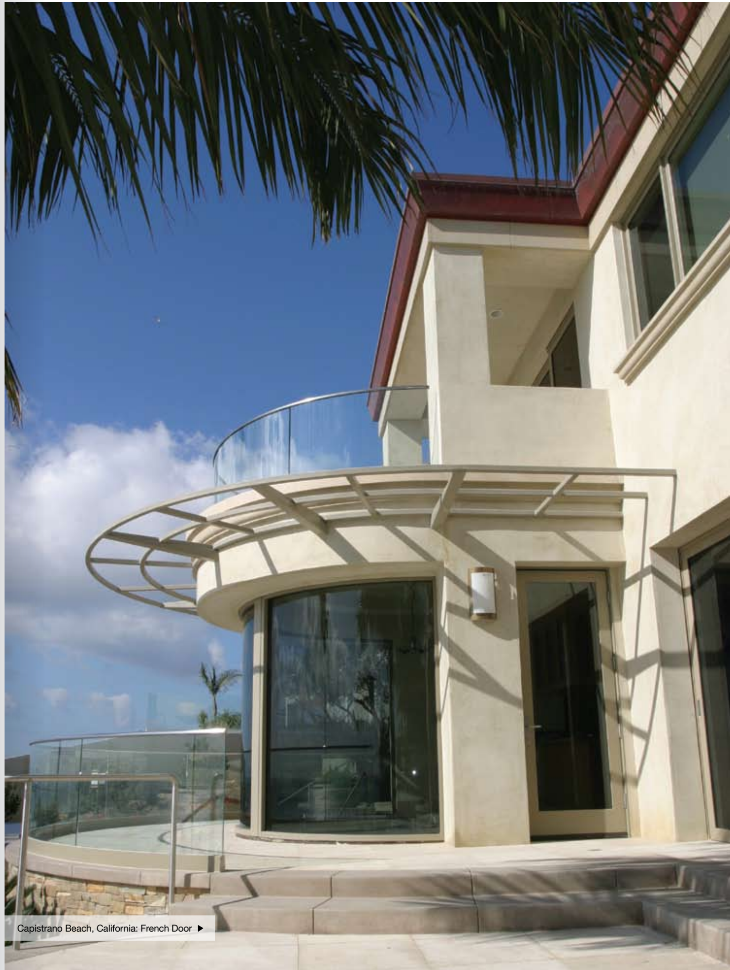
Capistrano Beach, California: French Door ▶