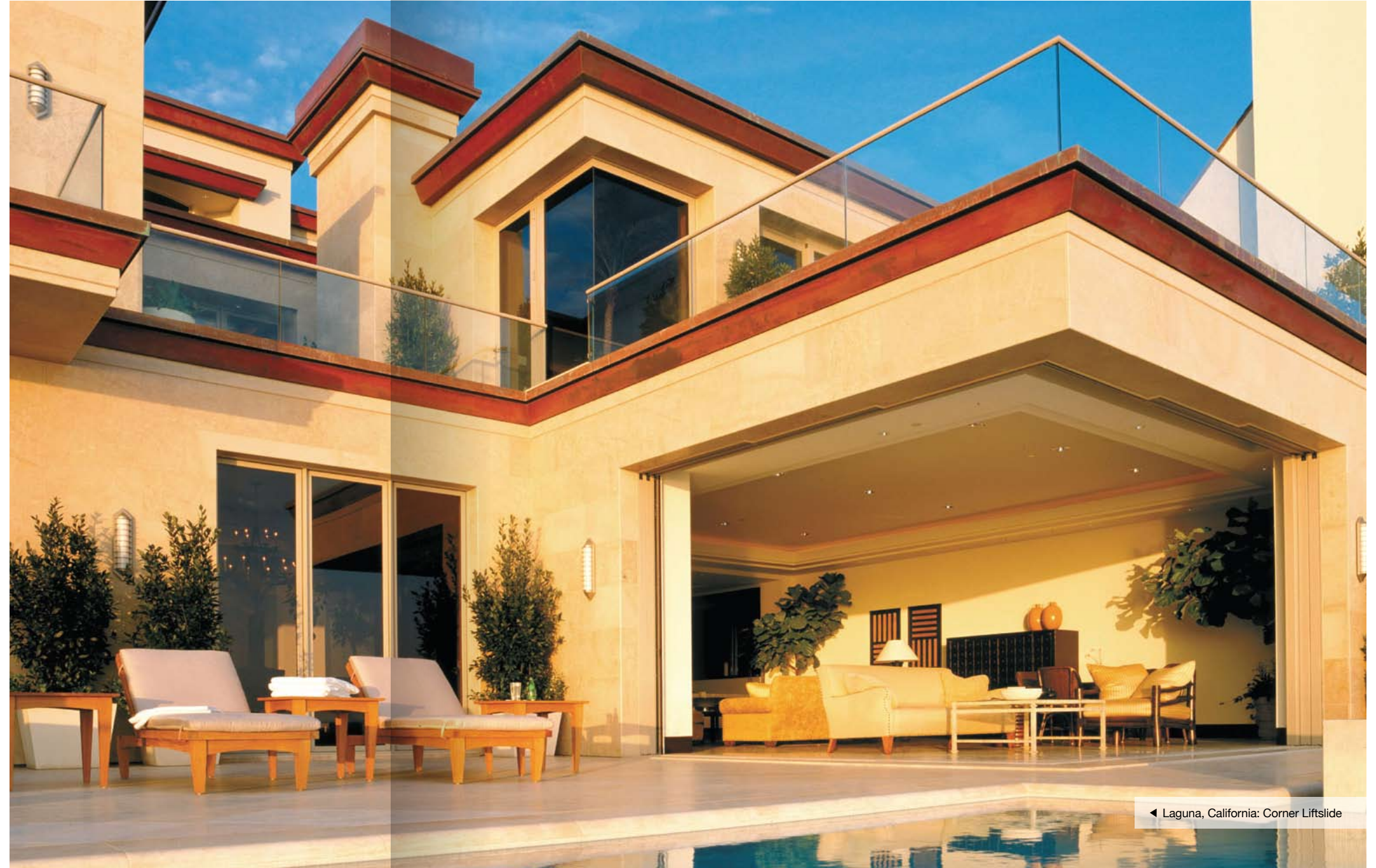
◀ Laguna, California: Corner Liftslide