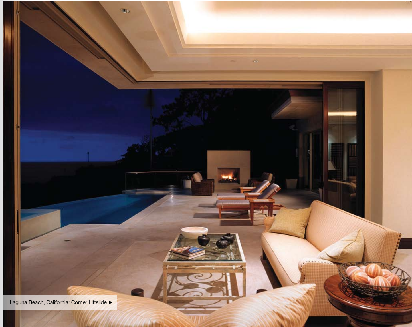
Laguna Beach, California: Corner Liftslide ▶