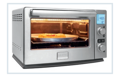
PowerPlus® Convection Browns and cooks faster and more evenly in less time.