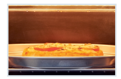
Rapid Cooking Infrared Technology Offers quicker preheating and cooking overall.