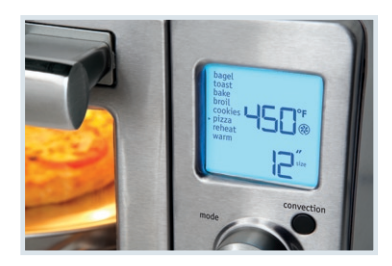
Pro-Select® LCD Display Large and easy-to-read display.