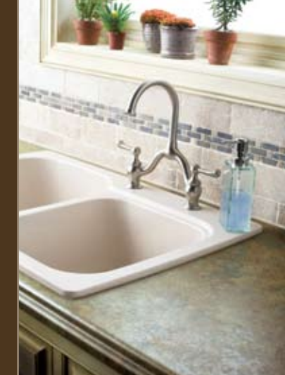
BARCELONA Madras Indian Slate 3688-77, Formica