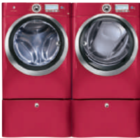
Red Hot Red (RR)