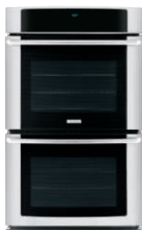
EW27EW65G (S/W/B) 27" ELECTRIC DOUBLE WALL OVEN