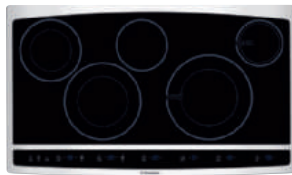
EW36CC55G (S/W/B) EW30CC55G (S/W/B) 36" & 30" INDUCTION HYBRID COOKTOP