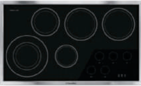
EW36IC60I (S/B) EW30IC60I (S/B) 36" & 30" INDUCTION COOKTOP