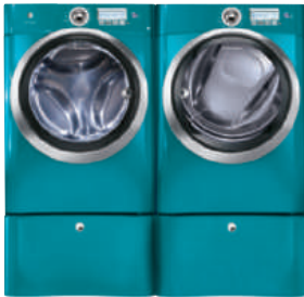
Turquoise Sky (TS)