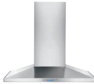
RH36WC55G (S) (36") RH30WC55G (S) (30") CHIMNEY WALL-MOUNT HOOD