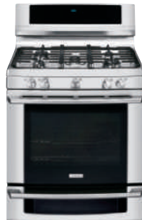
EW3LDF65G (LP Gas Only) (S/W/B) 30" DUAL-FUEL FREESTANDING RANGE