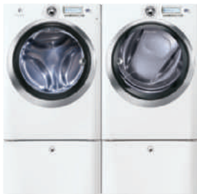
Island White (IW)