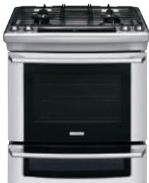
EW30DS65G (S/W/B) 30" DUAL-FUEL BUILT-IN RANGE