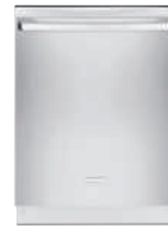
EIDW6105G (S/W/B) IQ-TOUCH™ BUILT-IN DISHWASHER