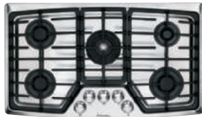
EW36GC55G (S/W/B) 36" GAS COOKTOP