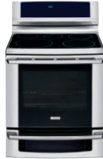
EW30EF65G (S/W/B) 30" ELECTRIC SMOOTHTOP FREESTANDING RANGE