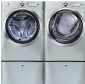
Silver Sands (SS)