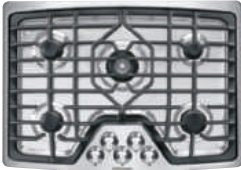
EW30GC60I (S) 30" GAS COOKTOP