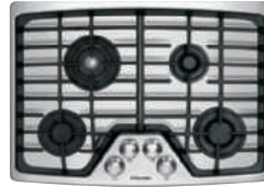
EW30GC55G (S/W/B) 30" GAS COOKTOP