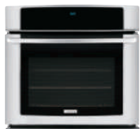
EW30EW55G (S/W/B) 30" ELECTRIC SINGLE WALL OVEN