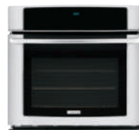
EW27EW55G (S/W/B) 27" ELECTRIC SINGLE WALL OVEN