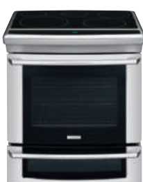
EW30ES65G (S/W/B) 30" ELECTRIC SMOOTHTOP BUILT-IN RANGE