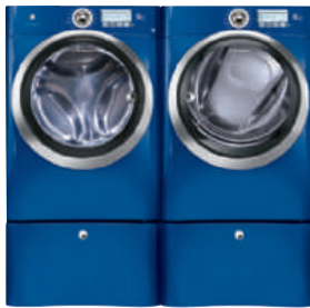
Mediterranean Blue (MB)