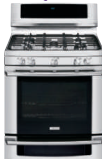
EW3LGF65G (LP Gas Only) (S/W/B) 30" GAS FREESTANDING RANGE