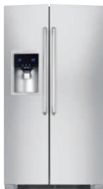
EW23CS701 1 (S/W/B) 23 CU. FT. REFRIGERATOR