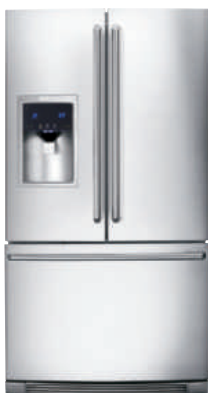
EW28BS711 1 (S/W/B) EI28BS561 2 (S/W/B) 28 CU. FT. FRENCH DOOR REFRIGERATOR