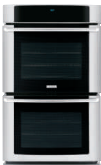
EW30EW65G (S/W/B) 30" ELECTRIC DOUBLE WALL OVEN