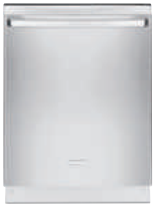
EWDW6505G (S/W/B) WAVE-TOUCH™ BUILT-IN DISHWASHER