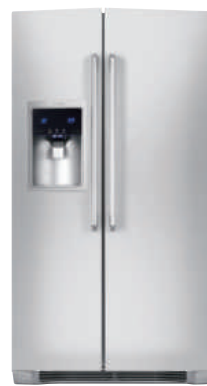
EW23CS65G 1 (S/W/B) EI23CS55G 2 (S/W/B) 23 CU. FT. REFRIGERATOR