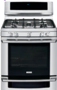
EW30GF65G (S/W/B) 30" GAS FREESTANDING RANGE