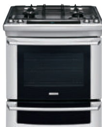
EW30GS65G (S/W/B) 30" GAS BUILT-IN RANGE