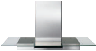
RH36WCT6G (S) (36") GLASS CANOPY WALL-MOUNT HOOD