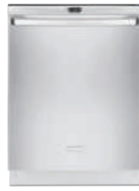
EIDW6305G (S/W/B) IQ-TOUCH™ BUILT-IN DISHWASHER