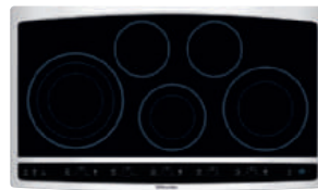
EW36EC55G (S/W/B) EW30EC55G (S/W/B) 36" & 30" ELECTRIC COOKTOP