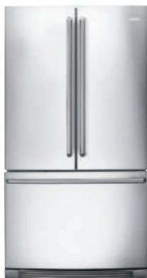
EI28BS361 2 (S/W/B) EI28BS511 2 (S/W/B) 28 CU. FT. FRENCH DOOR REFRIGERATOR