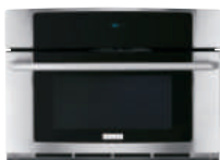
EW30MO55H (S) EW27MO55H (S) BUILT-IN MICROWAVE