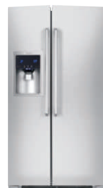
EW23SS65H 1 (S/W/B) EI23SS55H 2 (S/W/B) 23 CU. FT. REFRIGERATOR