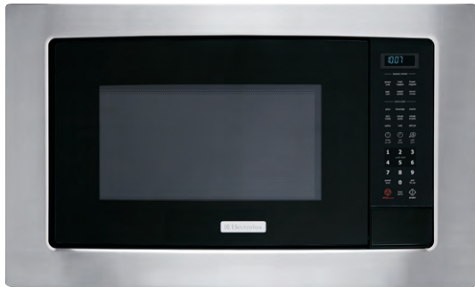
Microwave shown with Stainless Steel Faceplate