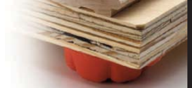
3/4" W•D ELITE PAD

This history combined with the latest in athletic floor technology and testing makes W•D Flooring and its athletic systems the premier choice for your sports flooring solutions.