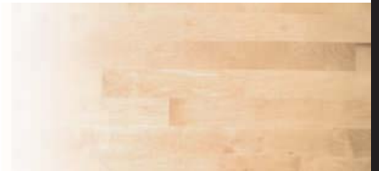
W•D HARD MAPLE 1ST GRADE