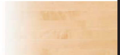
W•D HARD MAPLE PREMIUM EDGE GRAIN