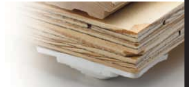
3/4" W•D WHITE PYRAMID PAD