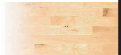
W•D HARD MAPLE 2ND AND BETTER