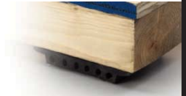
3/8" OR 5/8" W•D FLEX PAD