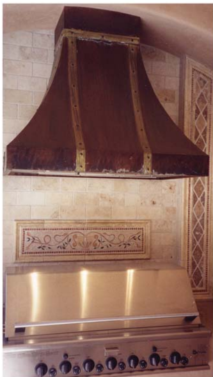
Welded copper hood with brass trim, brown patina, 3 lights and filters