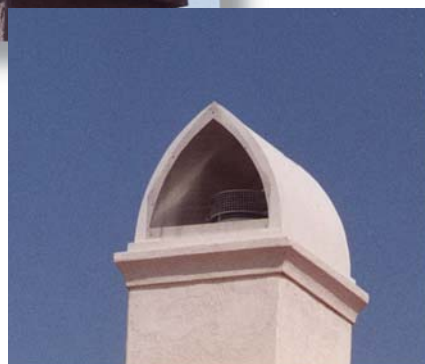
Custom bonderized decos