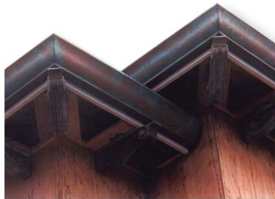
Alamo Ridge gutters (10" deep) at miter