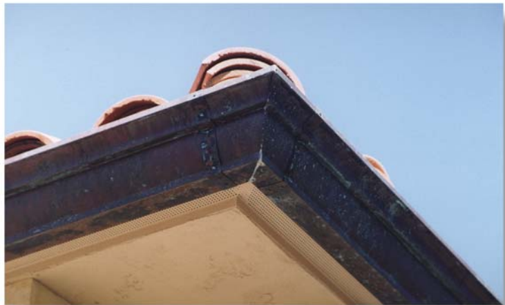
FineLine Eclipse Intrigue gutter with optional cover straps

Concord Sheet Metal Products creates many unique gutter designs to compliment the most challenging architectural details.