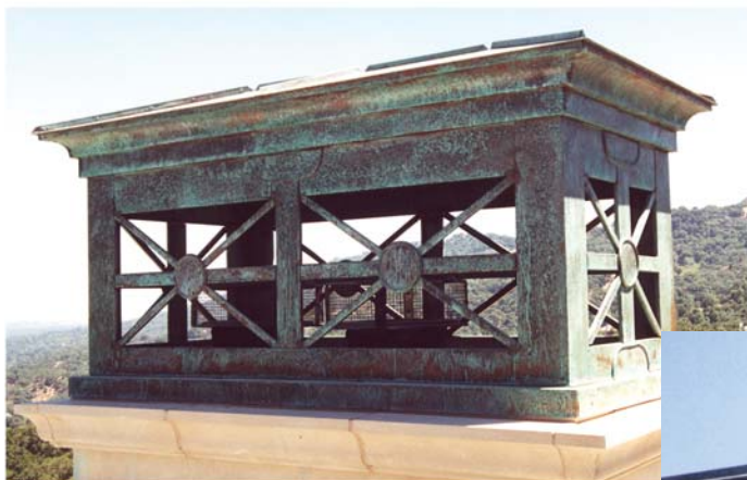
20 oz copper deco with 32 oz and 48 oz legs and deco trim

Concord Sheet Metal Products makes your unique design possible. We have fabricated hundreds of styles and can make your ideas become reality.