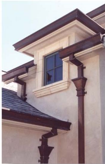
FineLine Tiburon 20 oz copper gutter with Tiburon leaderheads and 37 oz copper Fleur-De-Lis straps