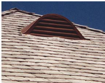
Winged style dormer vent (all styles and sizes available)