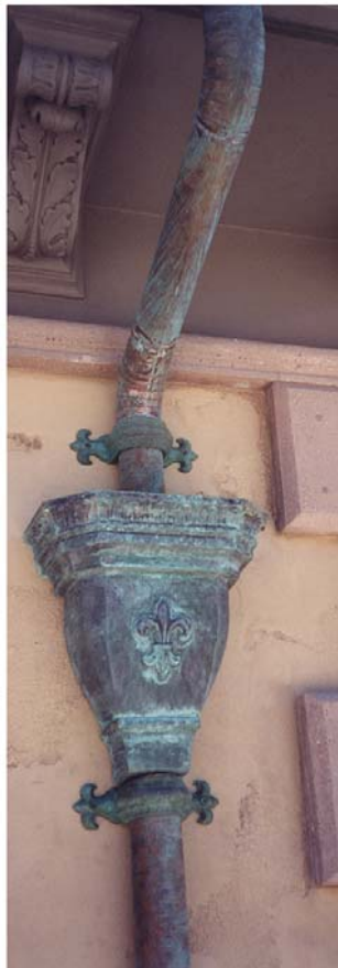
Eclipse cast bronze leaderhead with stamped copper rope

FineLine Architectural Gutters, created by Concord Sheet Metal Products, offer the quality and definition of brake formed products. These and other shapes are available in lengths to 20 feet. Fabrication of custom shapes available.