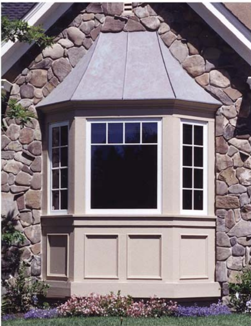
Bay window hood