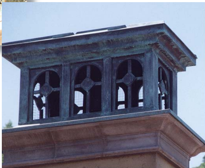
Custom ornate copper deco

Concord Sheet Metal Products makes your unique design possible. We have fabricated hundreds of styles and can make your ideas become reality.