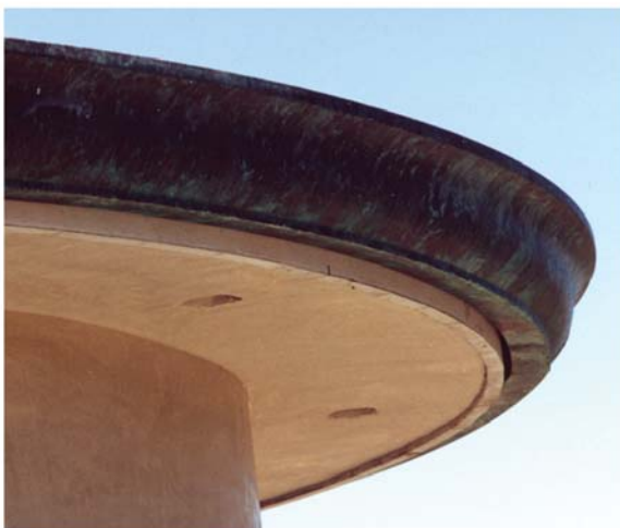
48 oz copper stretch formed Alamo Ridge gutter