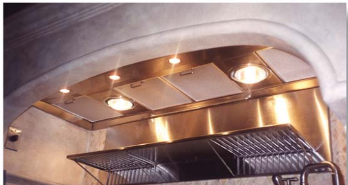
Custom hood liner with recessed halogen lights, heat lamps, filters and pot shelf