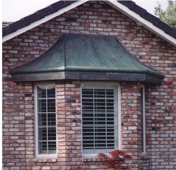
Copper bay window with radius bottom edge, Green-brown patina