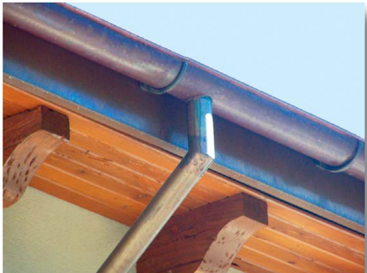
Half round copper gutter with cast bronze hangers on copper fascia panels. Also shown, 3" welded copper downspout.