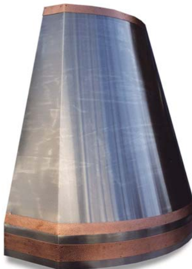
Welded stainless hood with hammered copper trim