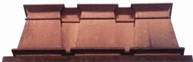
Custom ornate copper deco