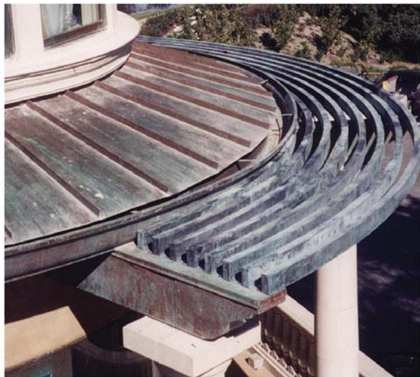
Copper tapered roof panels over stretched formed, 48 oz, Alamo Ridge copper gutter and 2" x 4" tube radiused, welded, copper coated and patina finished trellis

Field measuring, detailing and delivery available in Northern California