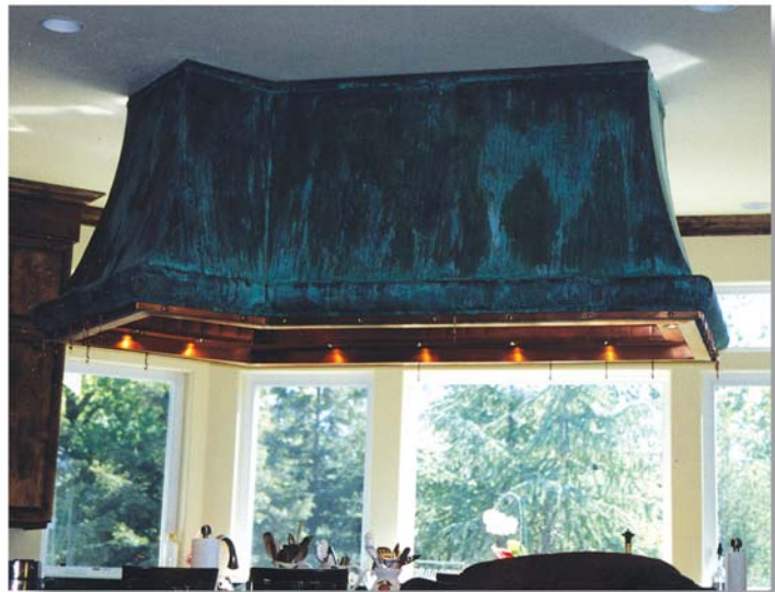
Welded 48 oz copper hood, 12' long. Patina green over brown outside. Quilted copper inside with 13 halogen lights and commercial baffle filters