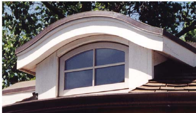
Copper bay dormer over raftered "Tahoe" gutter