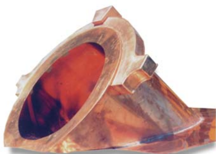
Copper eyebrow dormer