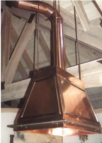
Copper hood with stainless trim and rail

Each FineLine Hood is unique. Choose from copper, brass, stainless steel, or powder coated steel.