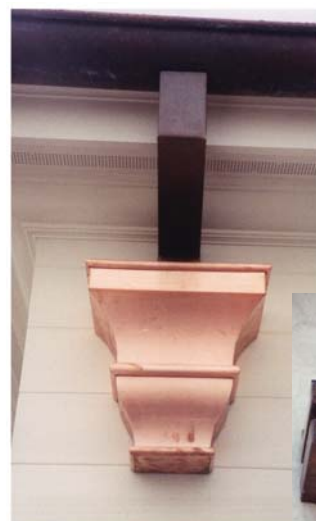
Custom copper leaderhead