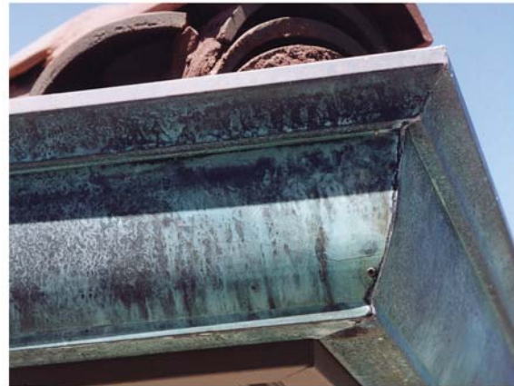
Eclipse Millennium gutter at miter. Patent# US D454,180 S