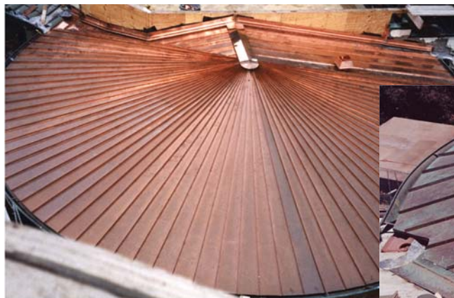
20 oz copper tapered panel roof