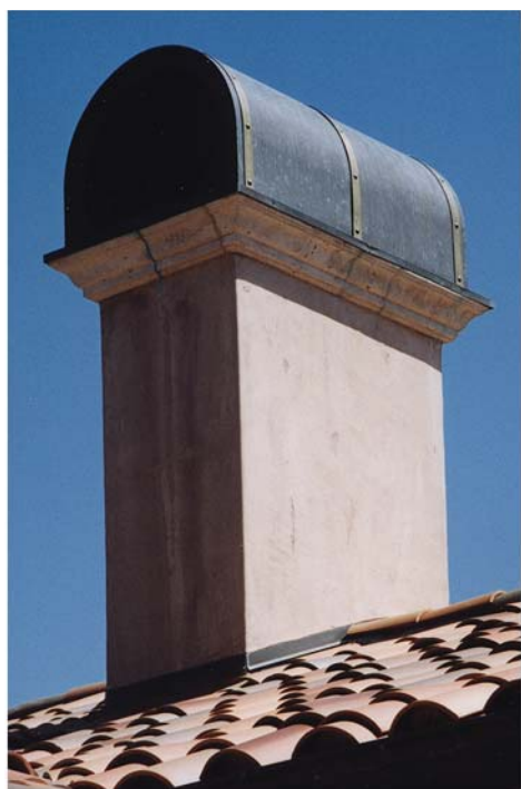
32 oz copper deco with brass bands and bronze bolts