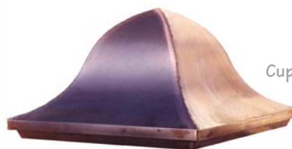
Cupola for gazebo