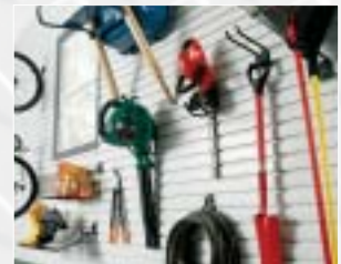
Accessories hang on both GearTrack™ Channels and GearWall® Panels.