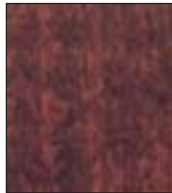
MAPLE BLACK CHERRY