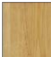
OAK NATURAL STANDARD