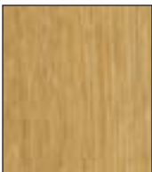
OAK NATURAL PRIME