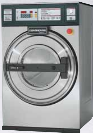
L1018 —18# Capacity

Continental offers double pressure transmitters to provide two water levels to enable operators to effectively handle both large and small load requirements.