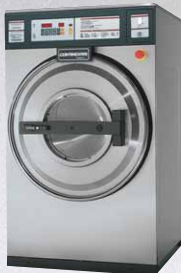
L1030 —30# Capacity