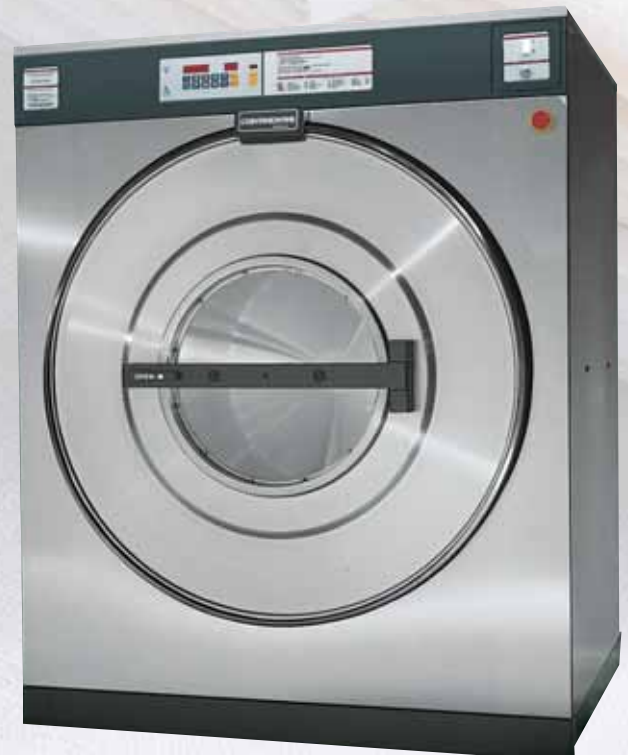
L1125 —125# Capacity