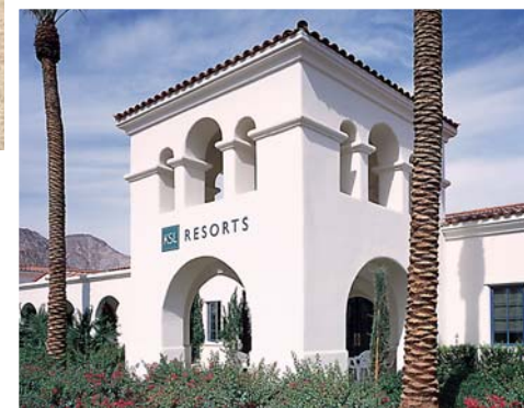
• KSL Recreation – La Quinta, California 17,724 sq. ft. complex built in only 90 days!

“Williams Scotsman stands heads above their competition. In addition to being able to supply us and our vendors with all kinds of construction products for our project they even let us occupy their offices and conference room for several months while our facility was being built.”