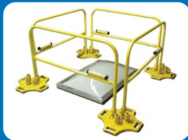
Skylight System protecting a 3' X 4' skylight.

Fall prevention that protects your investment while complying with OSHA regulations. It's that simple!