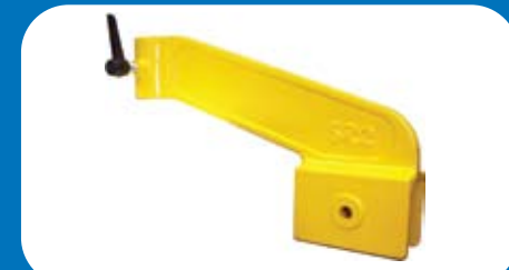
Toe Board Bracket (300025)