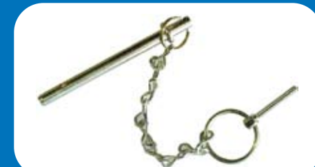
Securing Pin (100016)