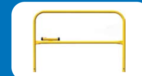
Rail: 3 ft (500105), 3 1/2' ft (500106), 4 ft (500104), 5 ft (500001), 7.5 ft (500004), 10 ft (500005)