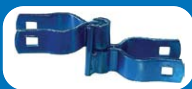
Our 90 deg. welded hinge. Allows the gate to only open away from the hatch.

In most situations, OSHA (Std. 29 CFR 1910.23) requires guardrail protection on the exposed sides of openings in roofs and floors. BlueWater Mfg. has modified our SafetyRail 2000 guardrail system to meet those safety concerns. Our Roof Hatch/Skylight Systems exceeds OSHA Std. 29 CFR 1910.23 and 1910.27. It is the only product available in the market with a gate assembly that meets the same OSHA regulations and REQUIRES NO DRILLING INTO ANY SURFACE for installation. The Roof Hatch/Skylight Systems set up in minutes and are easily dismantled for roof repair.