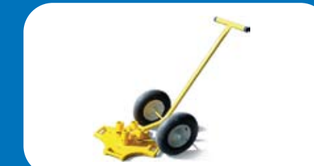
EZ Mover (500023)