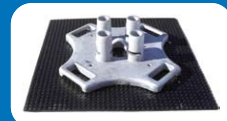
Galv. Base (300037) and EPDM Roof Pad (100034)