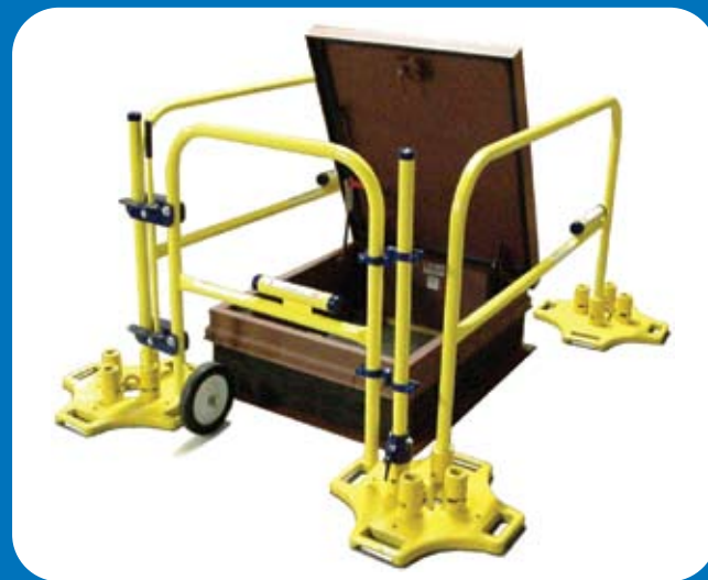
Roof Hatch System with OSHA compliant gate.