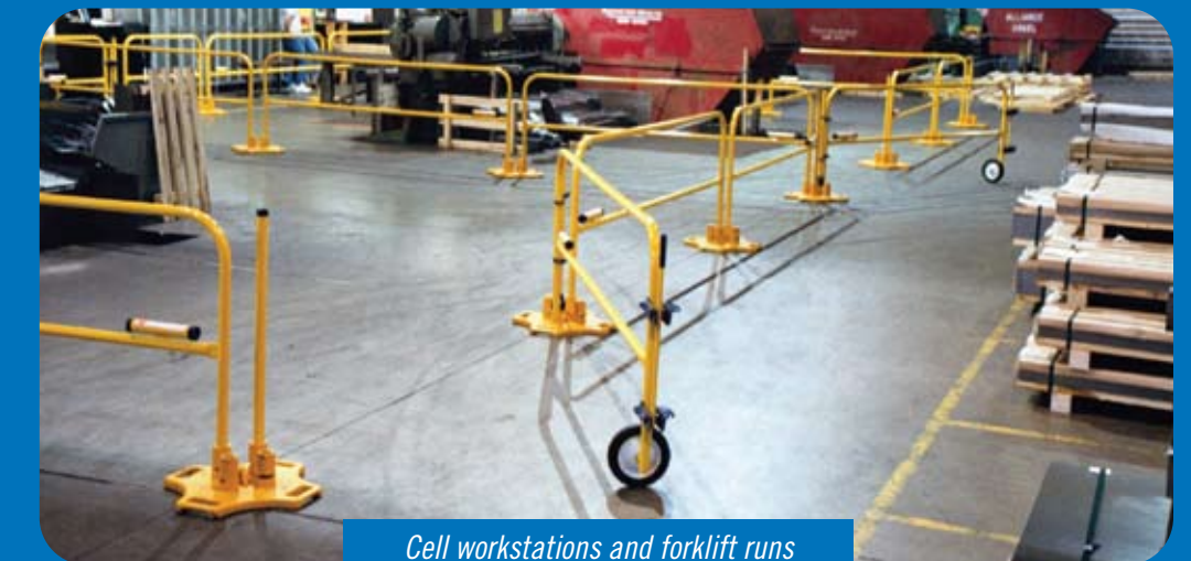
Cell workstations and forklift runs