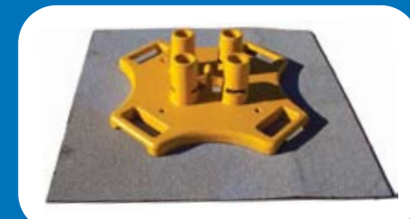
Std Base (300014) and BUR Roof Pad (100029)

Please inquire about various size gate kits, galvanized base kits and optional galvanized rail sections.