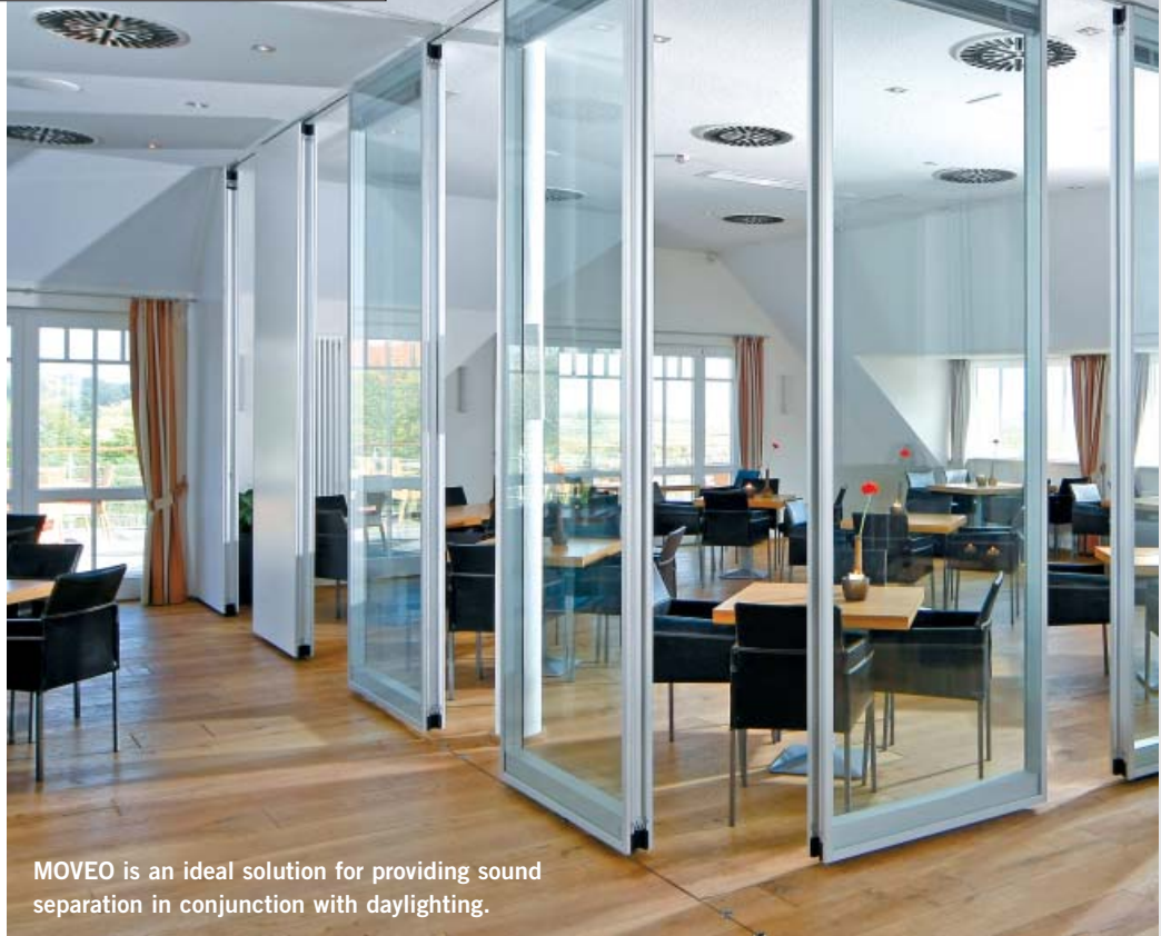
MOVEO is an ideal solution for providing sound separation in conjunction with daylighting.

Modernfold announces the next generation of operable partitions—MOVEO Glass. No longer is it necessary to choose between acoustics and glass. MOVEO Glass provides a sound solution with proven 45 STC lab performance. ComforTronic® Automatic Seals top and bottom are standard on MOVEO. Standard MOVEO Glass panels are double-pane glazed and available with optional designer glass solutions. Built-in, automatic venetian blinds are also available. Standard MOVEO panels can be integrated into a run to provide for work surfaces, design flexibility, and pass doors.