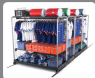
GEARBOSS® II HIGH-DENSITY STORAGE