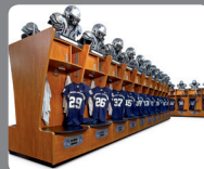
CUSTOMIZABLE WOOD LOCKERS