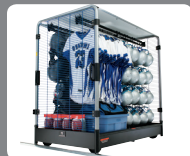
GEARBOSS® HIGH-DENSITY STORAGE