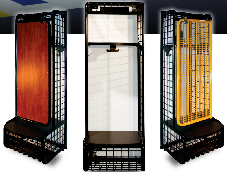
WOOD DOOR, OPEN AND GRILLE DOOR CONFIGURATIONS

Sheet metal hallway lockers and traditional gym lockers simply can't match these features or create a team room environment where varsity traditions are in a class of their own.