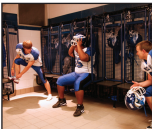
PAUL VI HIGH SCHOOL, HADDONFIELD, NJ WITH GRILLE DOOR OPTION