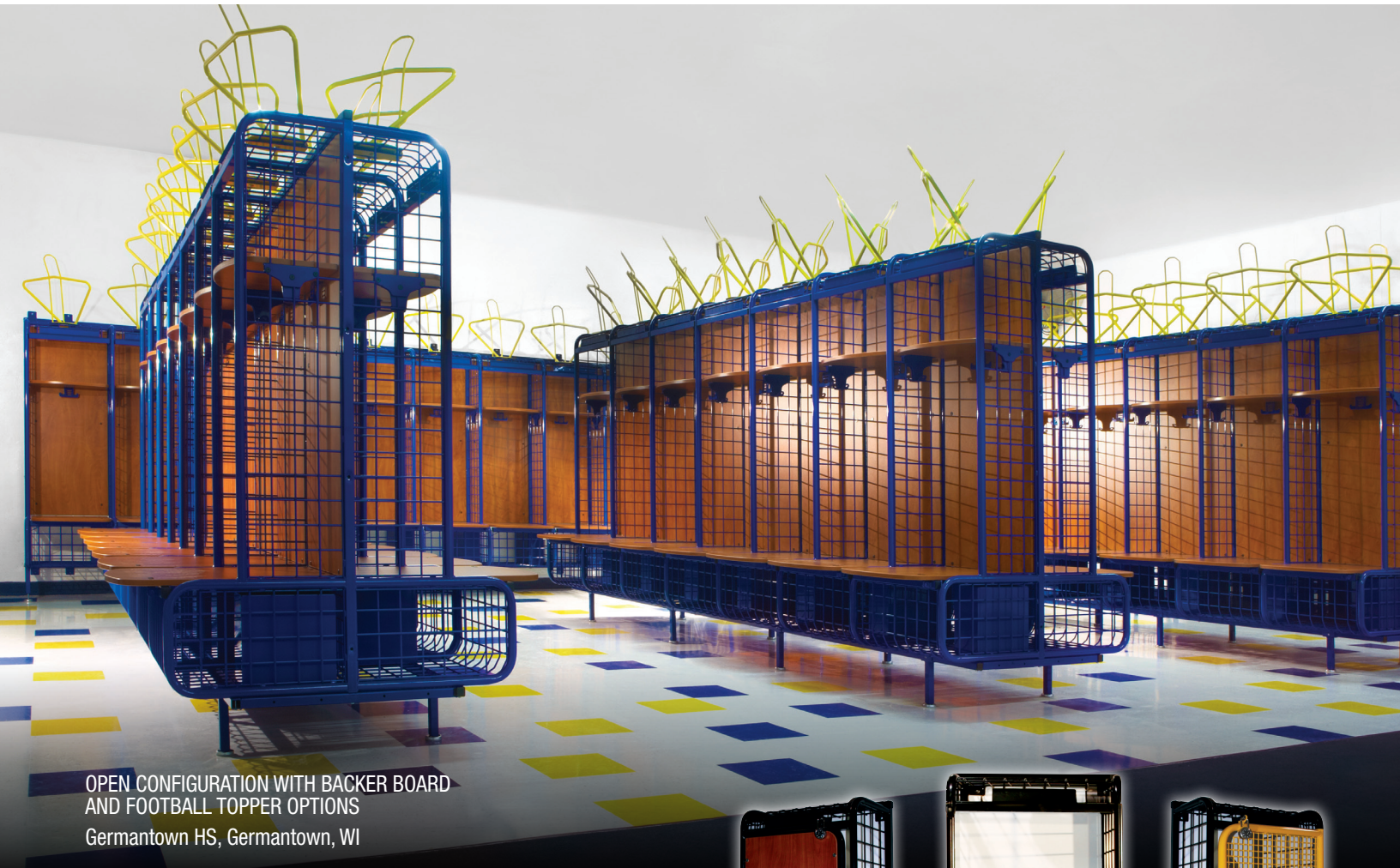
OPEN CONFIGURATION WITH BACKER BOARD AND FOOTBALL TOPPER OPTIONS Germantown HS, Germantown, WI