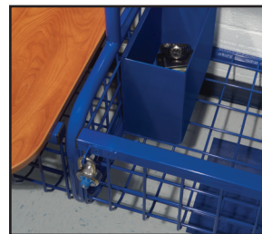
OPTIONAL STRONGBOX IN FOOTLOCKER