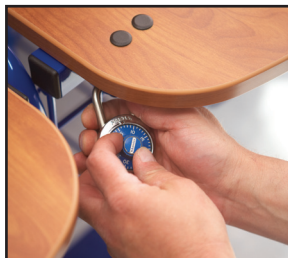
HINGED SEAT HASP LOCK WITH NO DOOR OPTION