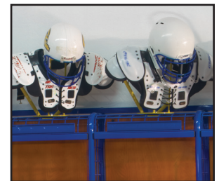
OPTIONAL FOOTBALL HELMET AND SHOULDER PAD TOPPER

©2010 Wenger Corporation USA/5-2010/2M/LT0286D