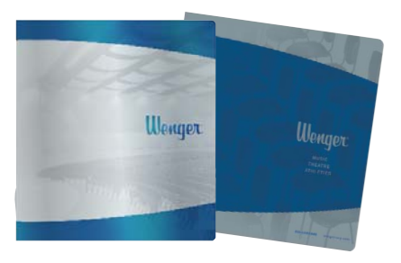
Complete information for the Architect and Interior Designer on all Wenger products for Music, Theatre and Athletics. Three-ring bound.