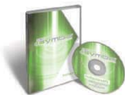
symbio self storage management software

Symbio software is the complete management and access control solution featuring a graphical site map, tenant management, billing management, reporting management, daily task manager and more. Available for single or multiple facilities, and an unlimited number of units.