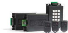
MicroPLUS rf controls