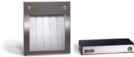
1700 add on directories and light kits