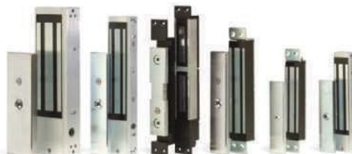
magnetic door locks