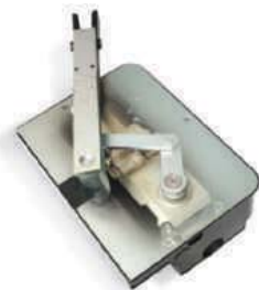
6400 in ground swing gate operator