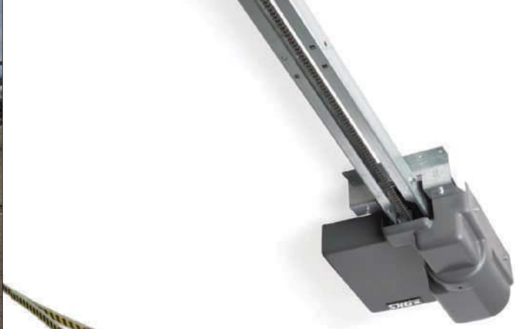
1150 overhead gate operator

For simple single lane traffic control, to more serious control DKS provides single barrier arms to automated spike systems and a full line of accessories: warning signs, stop/go signals, heater and fan kits, and a full line of slide and swing gate operators. Our 1150 model is designed for overhead type gates providing full gate automation in a minimum amount of space.