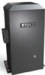
9050/9070/9100 vehicular slide gate operator