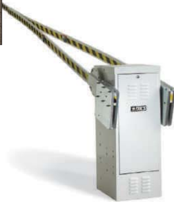
1602 barrier gate