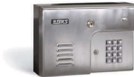
residential telephone entry system

In gated communities, our telephone entry and access control systems control all traffic, both pedestrian and vehicular, into and within the community. By use of coded cards or wireless devices, residents of the community are assured that only they have access to the pool, tennis courts, recreation facilities, or other restricted areas.