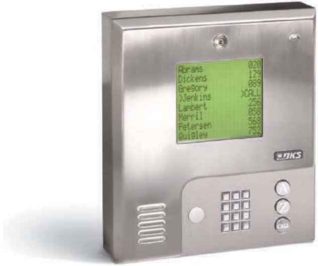
telephone entry system

For guest control, DKS telephone entry systems provide communication to the resident's home. Once the guest is identified, the resident can easily grant or deny access by simply pressing a button on their touch-tone telephone.