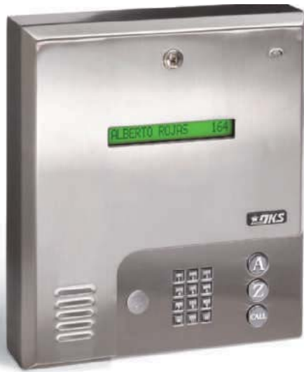
telephone entry system