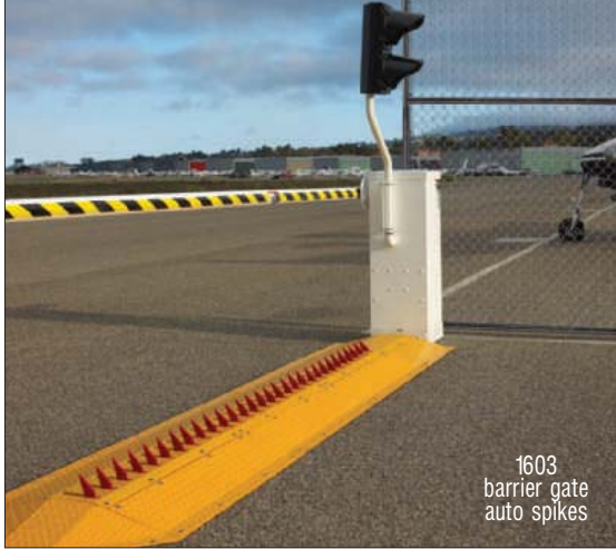
1603 barrier gate auto spikes