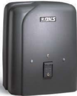
9310 vehicular slide gate operator