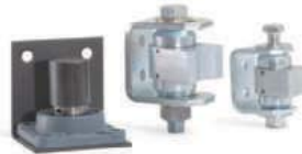
swing gate hinge assemblies