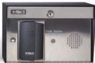
telephone entry with proximity card reader