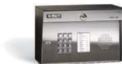
telephone entry with directory