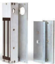
magnetic gate locks