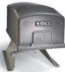
6300 swing gate operator