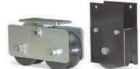
slide gate v-wheels