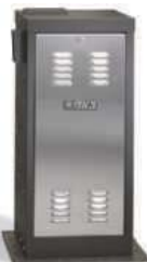
9210/9220/9230/9530 vehicular slide gate operator