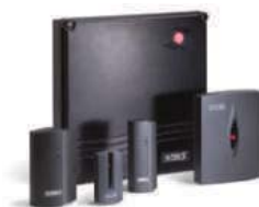
proximity card readers