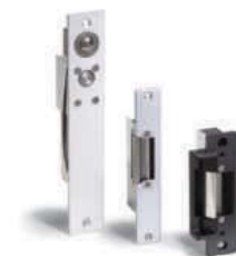
strikes and dead bolts