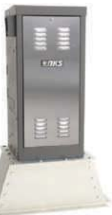
9210/9220/9230/9530 (shown with mounting pedestal)