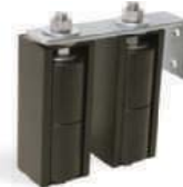
gate guide rollers