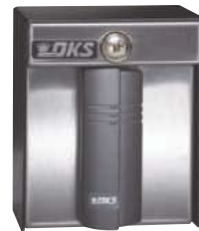
1520 stand alone card reader

From a complex parking/access control system, to even a simple single door requirement, DKS systems can give you control of all traffic – both pedestrian and vehicular – into and within your building. Residents and administrators are assured that only authorized persons have access to private areas.