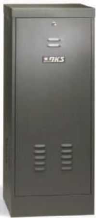
2000 power inverter and back up