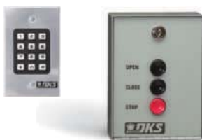
gate operator control stations