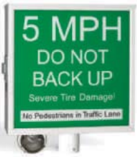
1610 warning signs and signal lights