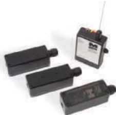
gate contact sensors