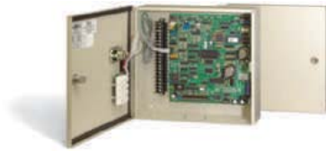
1838 multi door access controller