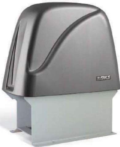
9550 vehicular slide gate operator