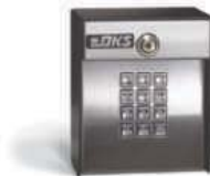
1503 or 1506 stand alone keypad