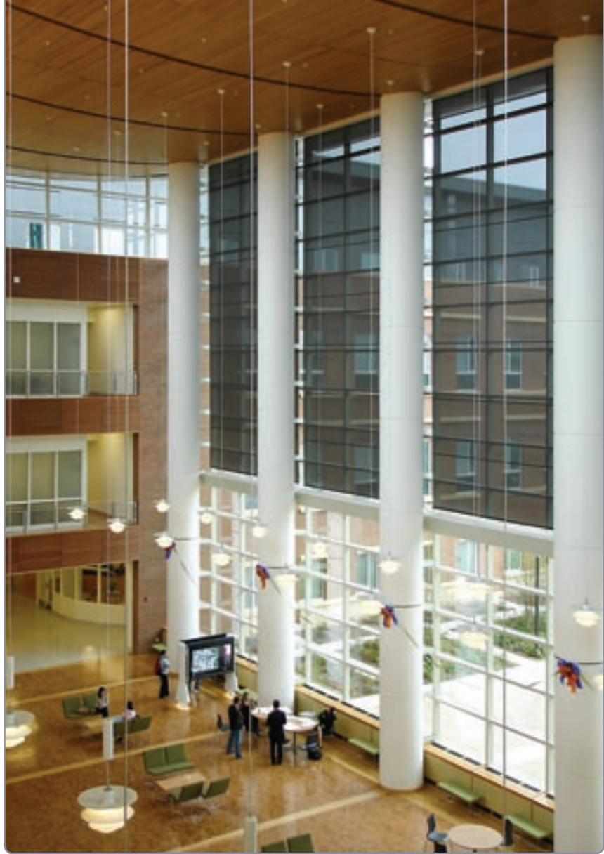
Colossal FlexShades, 20' wide x 40' high and 20' wide x 20' high, with Mermet E-Screen fabric (1% and 5% open), operated by sun sensor. Business Institute of Finance at the University of Illinois. Design Architect: Pelli Clarke Pelli Architects, New Haven, CT.

Bottom of extruded aluminum case is fully enclosed except for slot allowing fabric passage. Bottom closure panel may be removed manually for access to roller and drive unit. Patent pending.