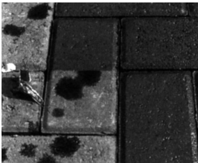
Figure 4. Sealers resist stains which makes them ideal for high use areas where they might occur.