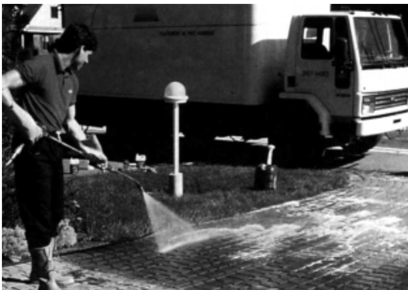
Figure 2. Pressurized cleaning equipment used by professional cleaning and sealing companies can bring out the best appearance from pavers.

Efflorescence does not affect the structural performance or durability of concrete pavers. The reaction which takes place is the formation of water soluble calcium bicarbonate from calcium carbonate, carbon dioxide and water. It may appear immediately or within months following installation. Efflorescence may reach its peak in as short as 60 days after installation. It may remain for months and some of it may wear away. If installation takes place