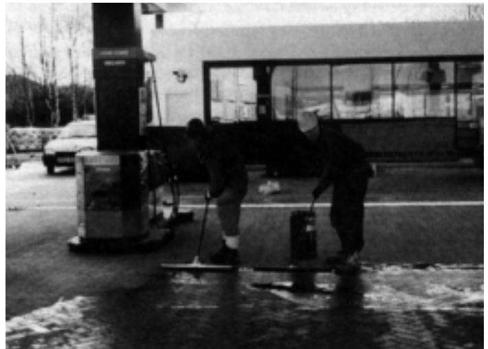
Figure 5 (above left) and Figure 6 (above right). Urethane is applied with squeegees to stabilize joint sand between pavers in air-craft pavement and at a gas station.

coats, the first coat is usually applied to saturation. A light second coat, if needed, can be applied for a glossy finish. Be careful not to over apply the sealers such that the surface becomes slippery. For water based sealers requiring two coats, always apply the second coat while the first coat is still very tacky. Prevent all traffic from entering the area until the sealer is completely dry, typically 24 hours.