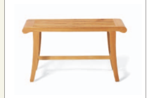
Occasional Bench (15LB) 34"W x 13"D x 18"H 738989

Though their styles are diverse, our teak benches share one common thread: they are all built to last. Part of what makes Premium Teak™ so special is its sheer strength; we use only the densest cuts of teakwood with the straightest grain. Couple this with teak's natural ability to withstand all types of weather without warping or buckling, and the result is a bench that will remain rock-solid and attractive through years of heavy use, indoors or out. For cushions, see page 76.