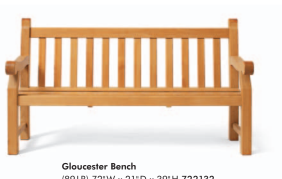
(89 LB) 72"W x 21"D x 39"H 722132 Classic Fabric Cushion 870592 Luxury Fabric Cushion 870790