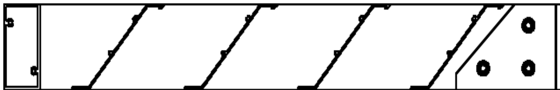
STANDARD HORIZONTAL SECTION