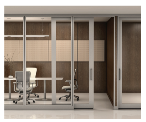
LifeSPACE ERA Sliding Door

Factory built LifeSPACE ERA walls are fully modular, unitized, and non-progressive with integrated utilities, allowing a space to easily adapt to changing business needs.