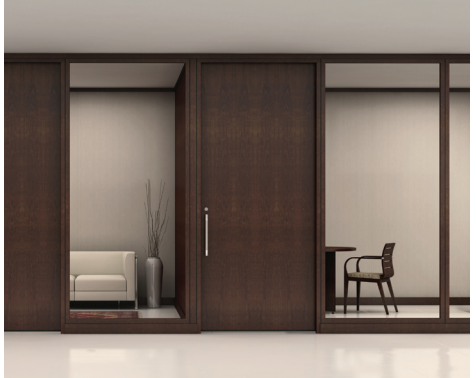
LifeSPACE ERA Glass and Wood Walls