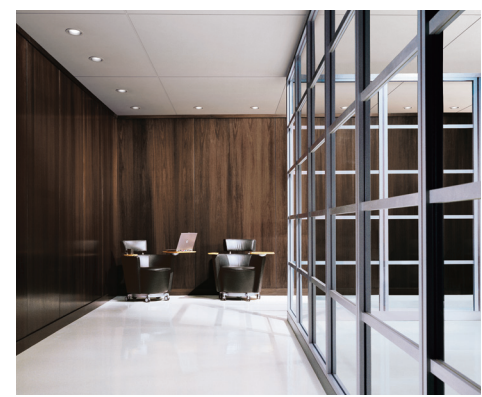
LifeSPACE ERA Glass Wall with Mullions