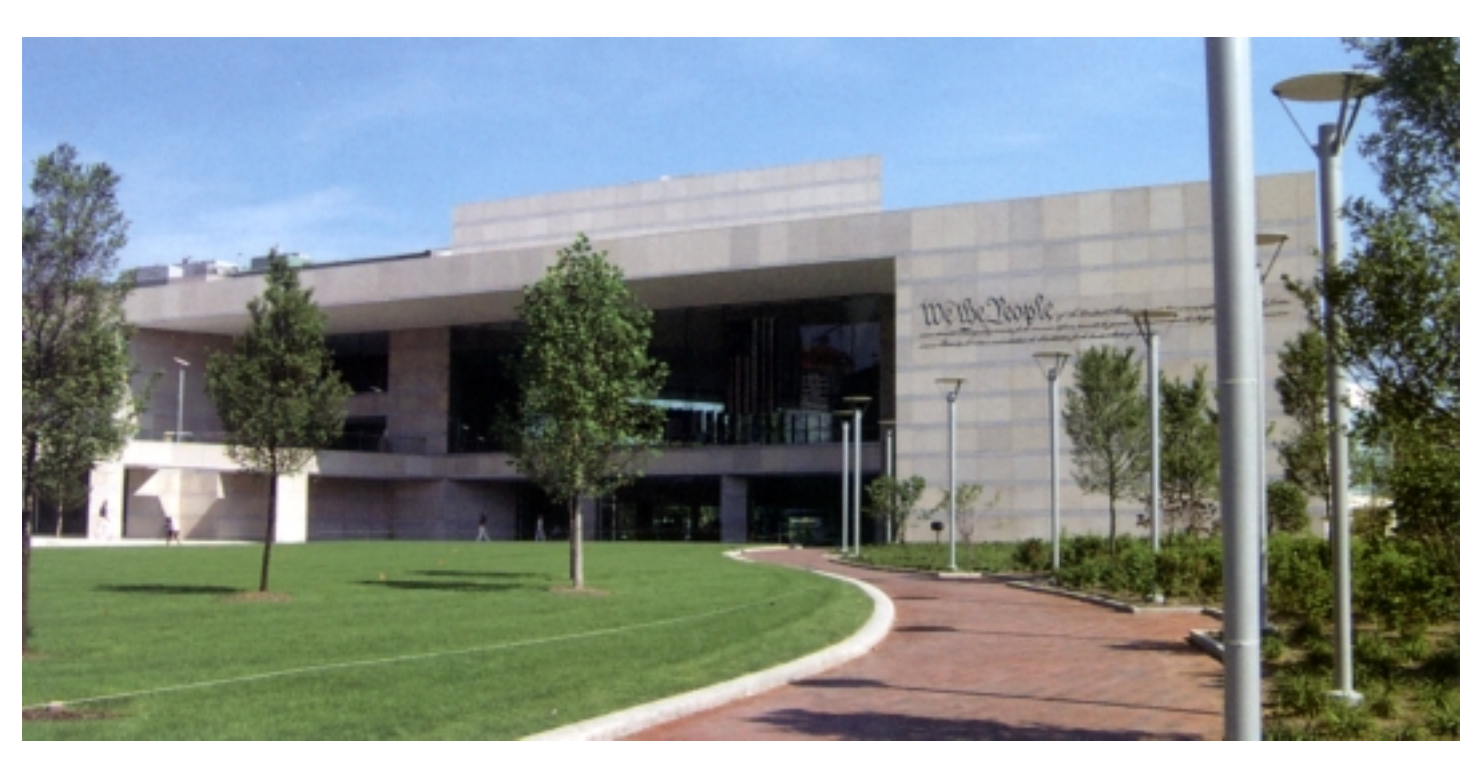
The National Constitution Center, the first museum devoted to honoring and explaining the U.S. Constitution, opened on July 4, 2003 in Philadelphia, PA. The exterior of the building features a facade of Select Buff Indiana limestone broken up by 8-inch bands of Chelmsford granite. The limestone was supplied by Indiana Limestone Co. of Bedford, IN, and the granite by Fletcher Granite Co. of N. Chelmsford, MA. StoneLite™ panels were produced by Stone Panels, Inc.

ften referred to as the "City of Brotherly Love," Philadelphia has stamped its mark in history many times over. William Penn, who had received the title to Pennsylvania in a land grant from King Charles II of England, first established a site for Philadelphia in