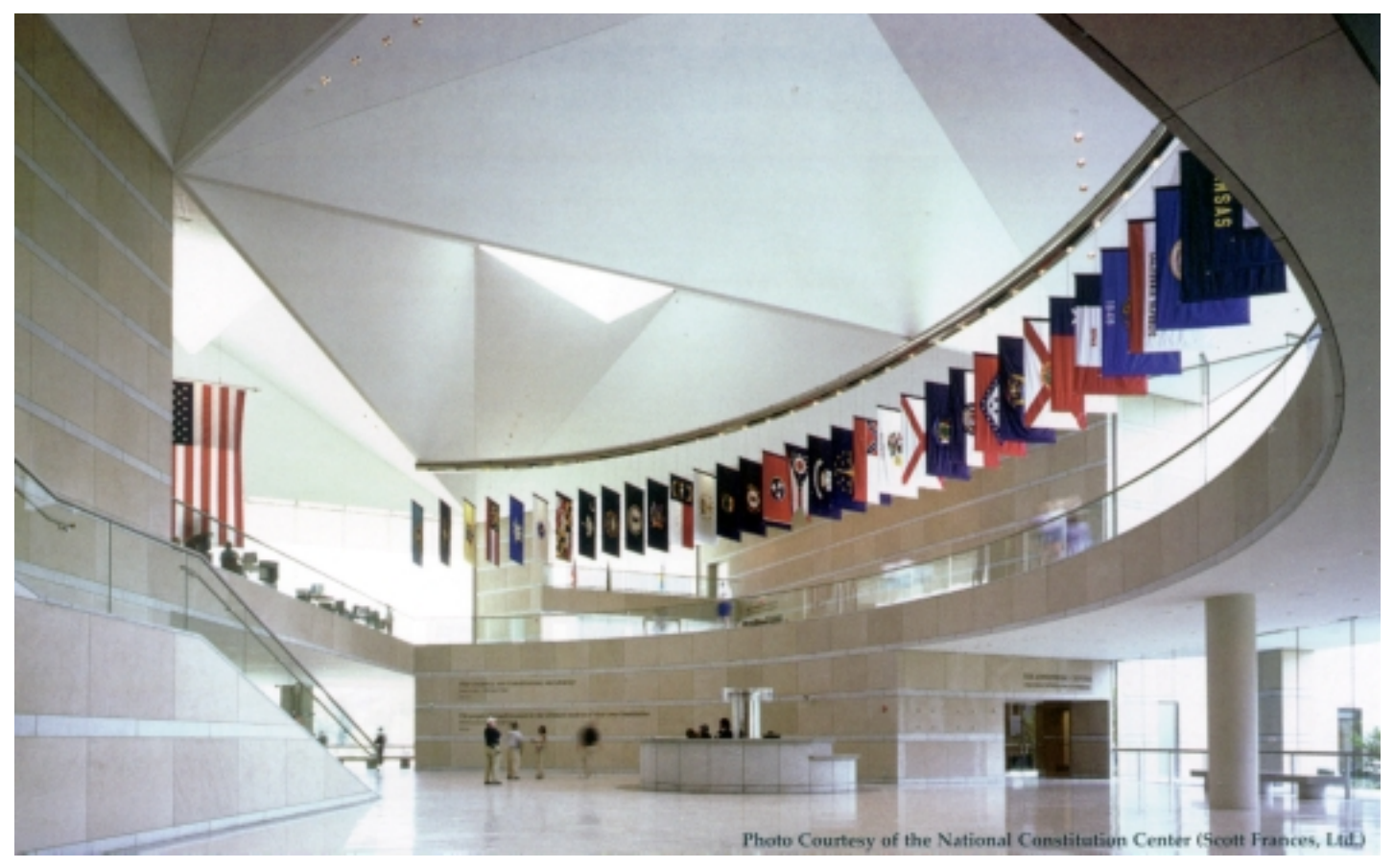
To create the lightweight wall panels, solid rough sawn slabs of limestone are sandwiched between two 3/4-inch-thick pieces of aircraft quality aluminum honeycomb by adhesion, using a proprietary high-strength, fiber-reinforced epoxy. After curing, the slabs are cut through their center thickness by a diamond tip saw, resulting in 3/4-inch stone thickness.