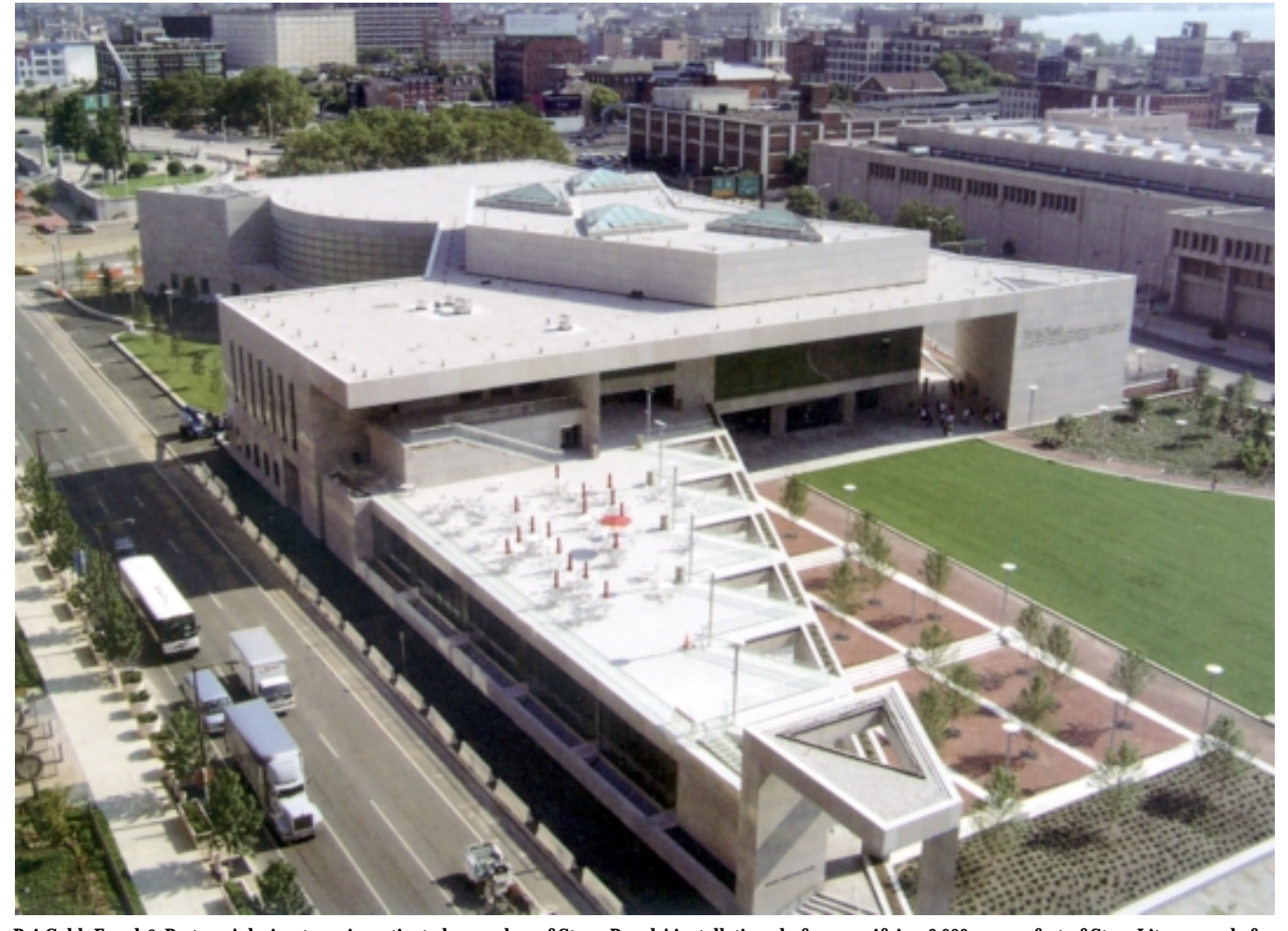
Pei Cobb Freed & Partners' design team investigated a number of Stone Panels' installations before specifying 9,000 square feet of StoneLite™ panels for exterior walls over the atrium.

doors on July 4, 2003 at the northern end of Independence Mall.