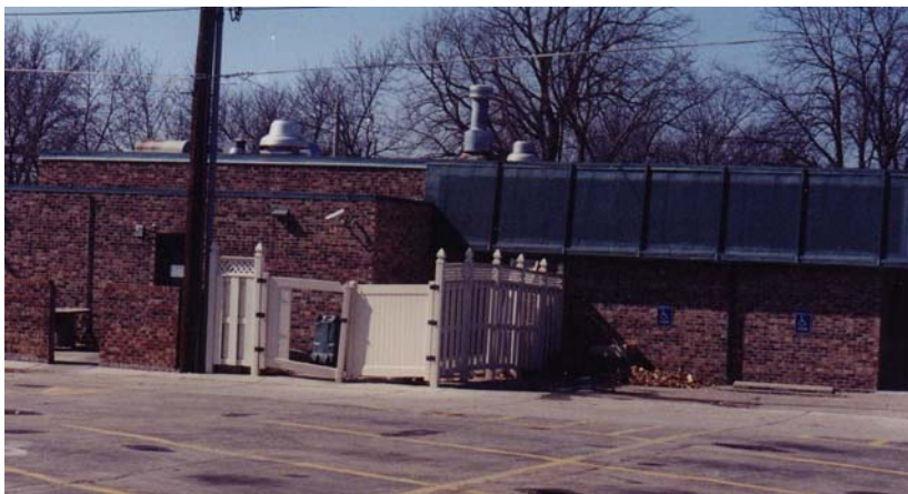
Gate without sockets