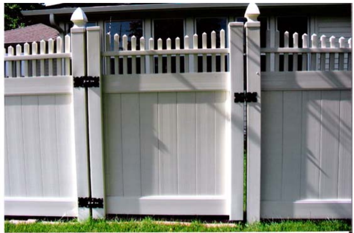
Country Estate gate with sockets