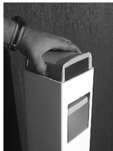
Country Estate socket