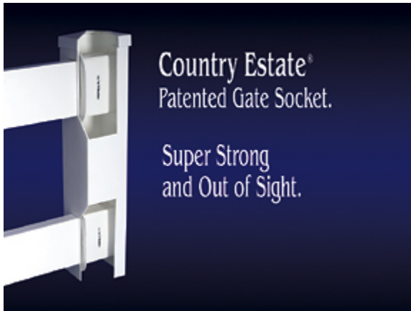
Country Estate gate with sockets

The patented Country Estate gate socket was designed to provide rigidity to PVC gates. The socket fits tightly into a hollow PVC post and is positioned over each routed hole in a gate post. It is cemented to the inner walls of the post, and due to its structural design, provides rigidity to the horizontal gate rails, which are eventually cemented and secured in the sockets with screws, after being inserted into the sockets when the gate is assembled.