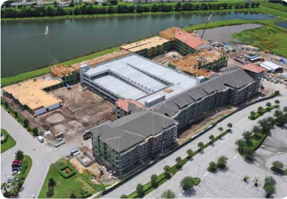
Millennia Apartments Orlando, FL Architect: Cline Design GC: The Wieland Davco Corporation