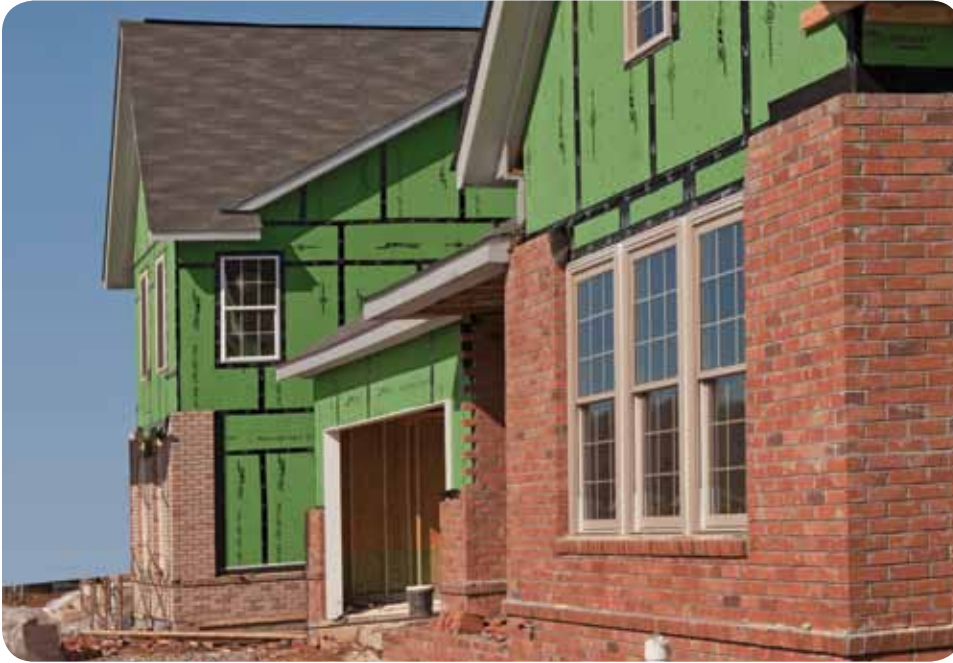
Miller & Smith Ashburn, VA