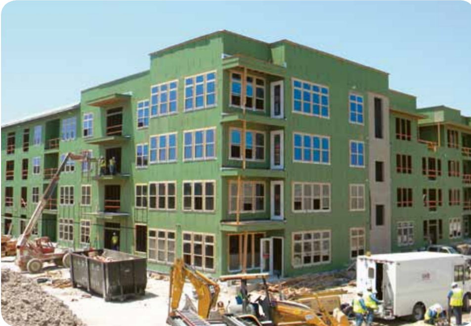
Cevallos Lofts San Antonio, TX Architect: Alamos Architects Owner/GC: NRP Group