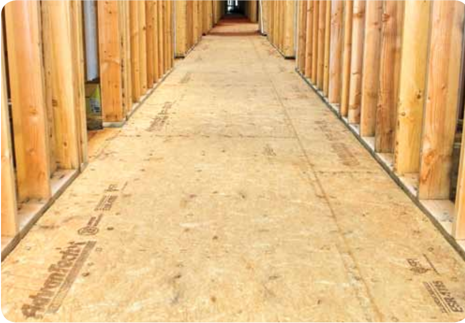
Abundant Life Living Springs Delanco, NJ Architect: Kitchen & Associates GC: Domus