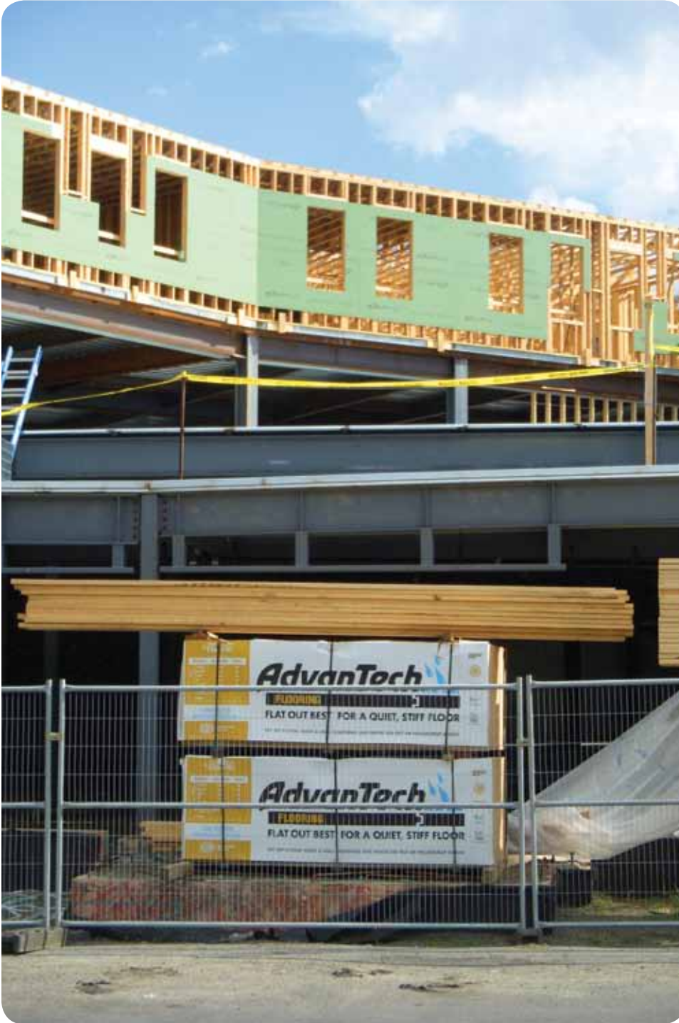
Battleboro Food Co-op Vermont Architect: Gossens Bachman Architects GC: Baybutt Construction