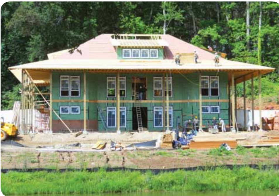
Golf Facility South Carolina