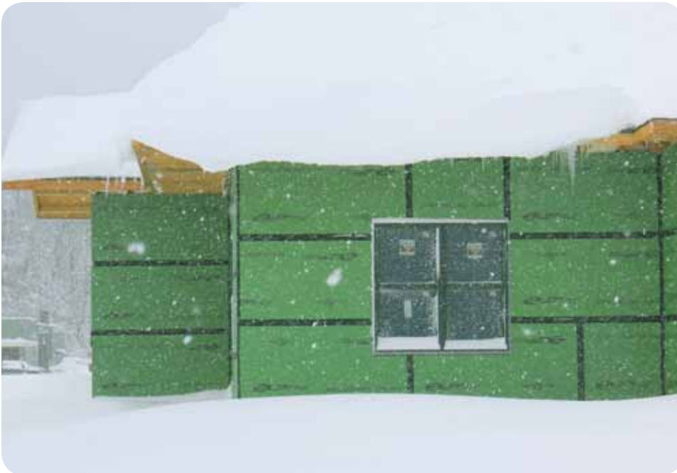
Office Building New York