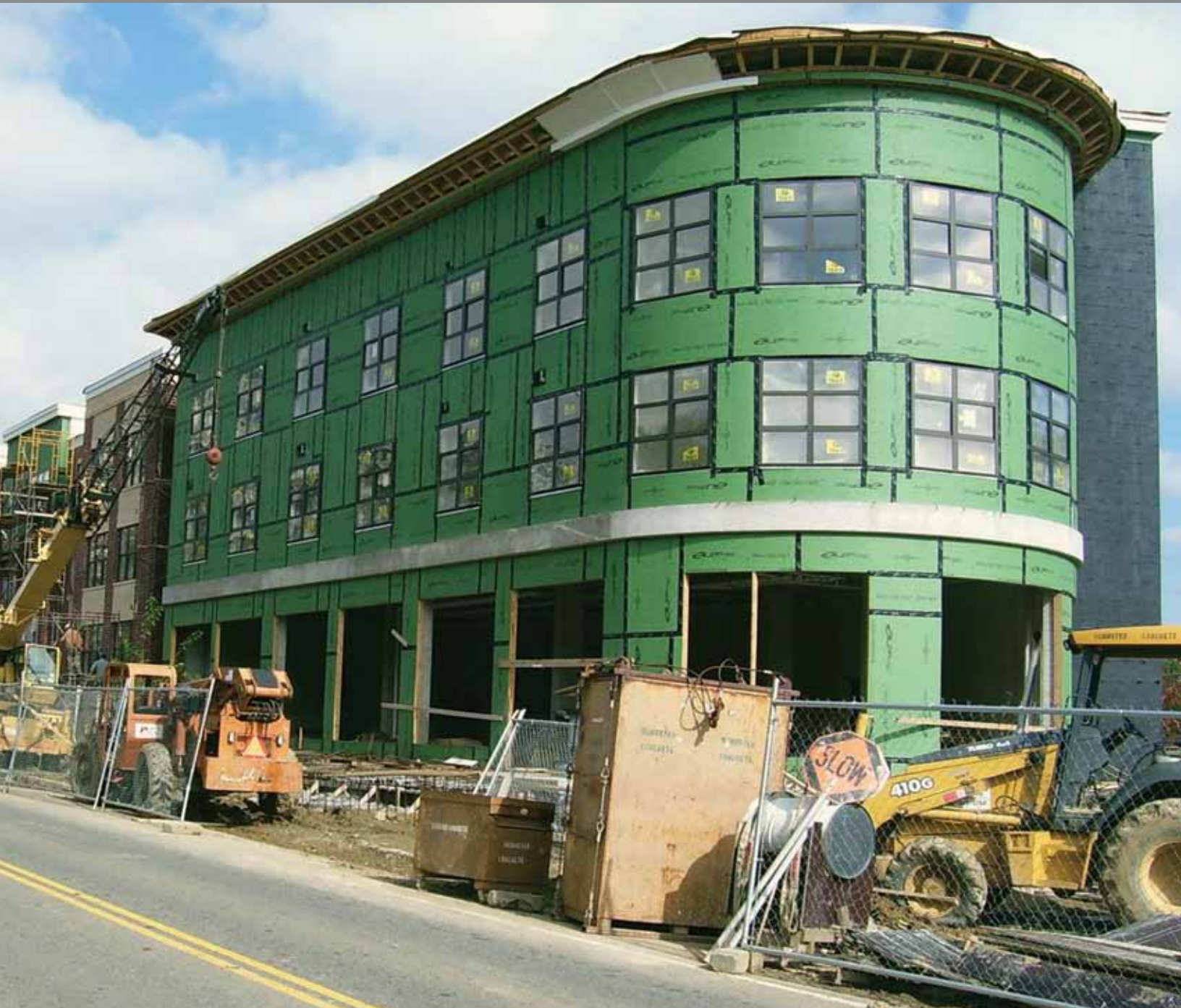
Mt. Vernon Commons Alexandria, VA Heffner Architects, PC GC: Clark Builders Group