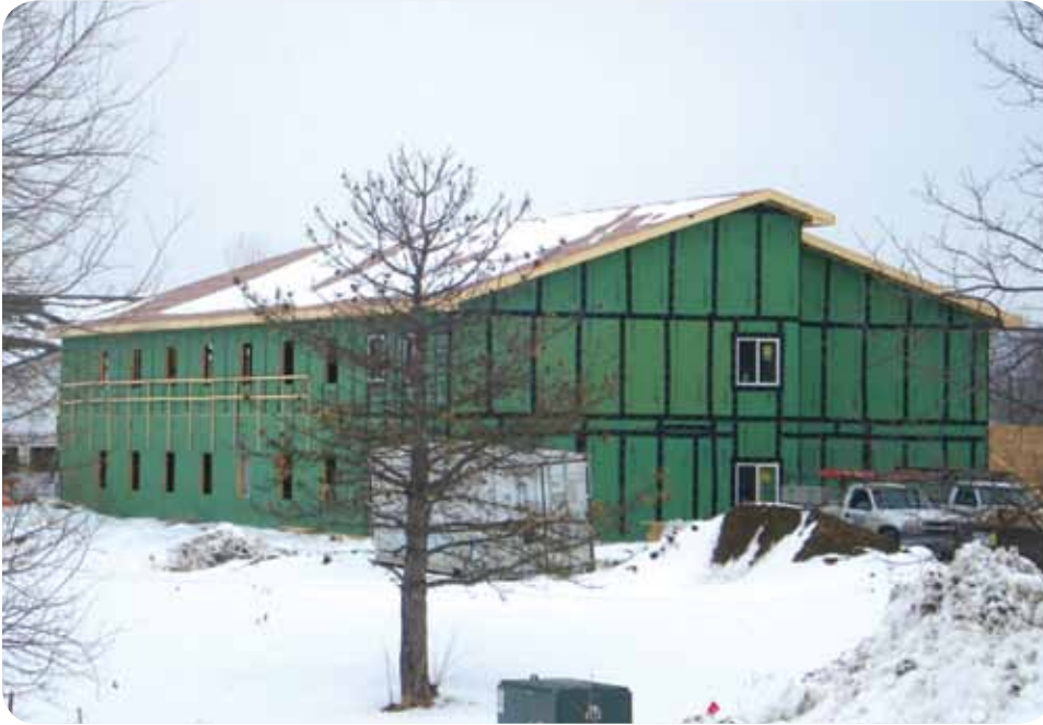
Trinity Village Papillion, NE Architect: Schemmer & Associates Owner: Immanuel Communities GC: The Weitz Company