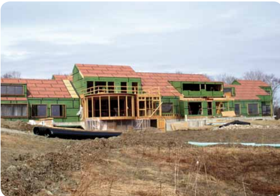
Cohousing Development Portland, ME GC: Wright-Ryan Construction