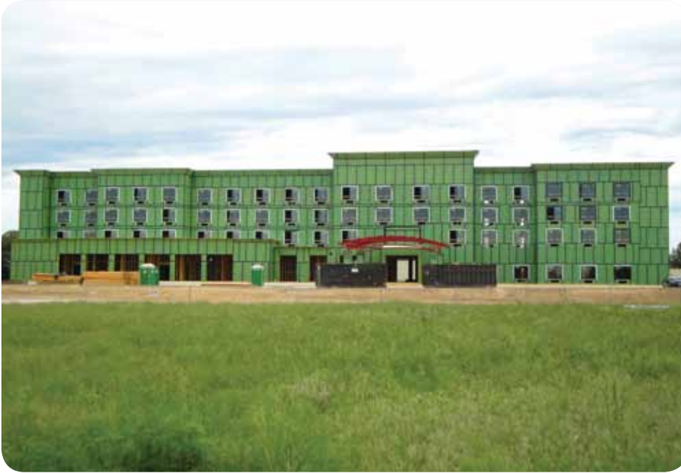
Holiday Inn Round Rock, TX