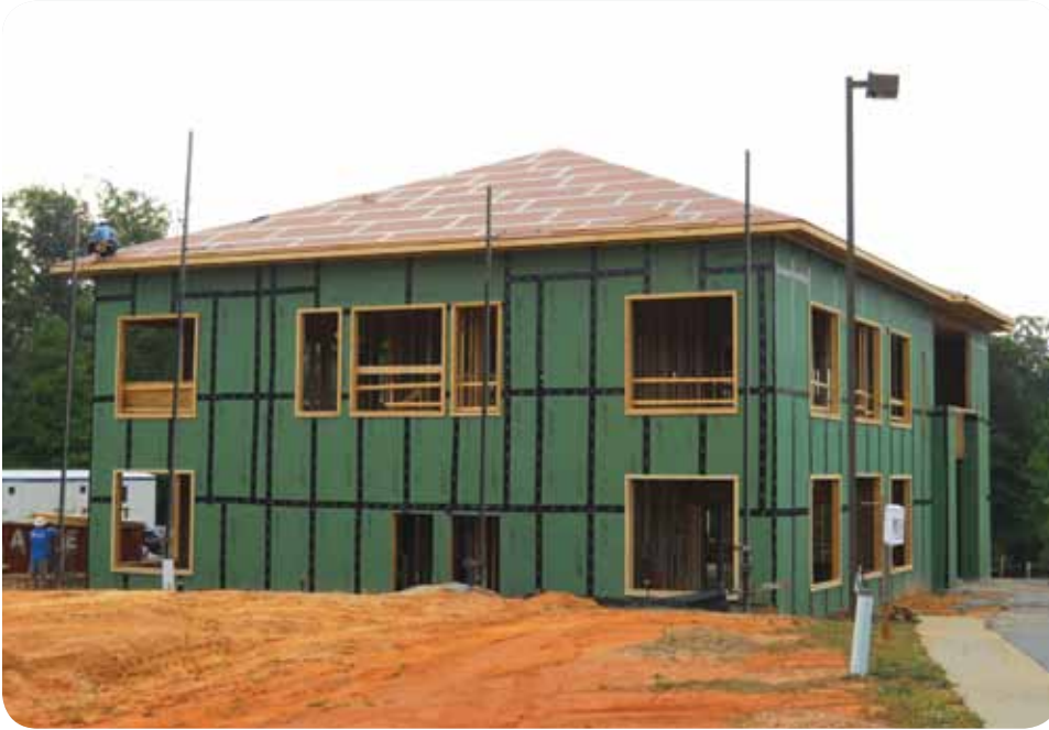
Medical Office South Carolina