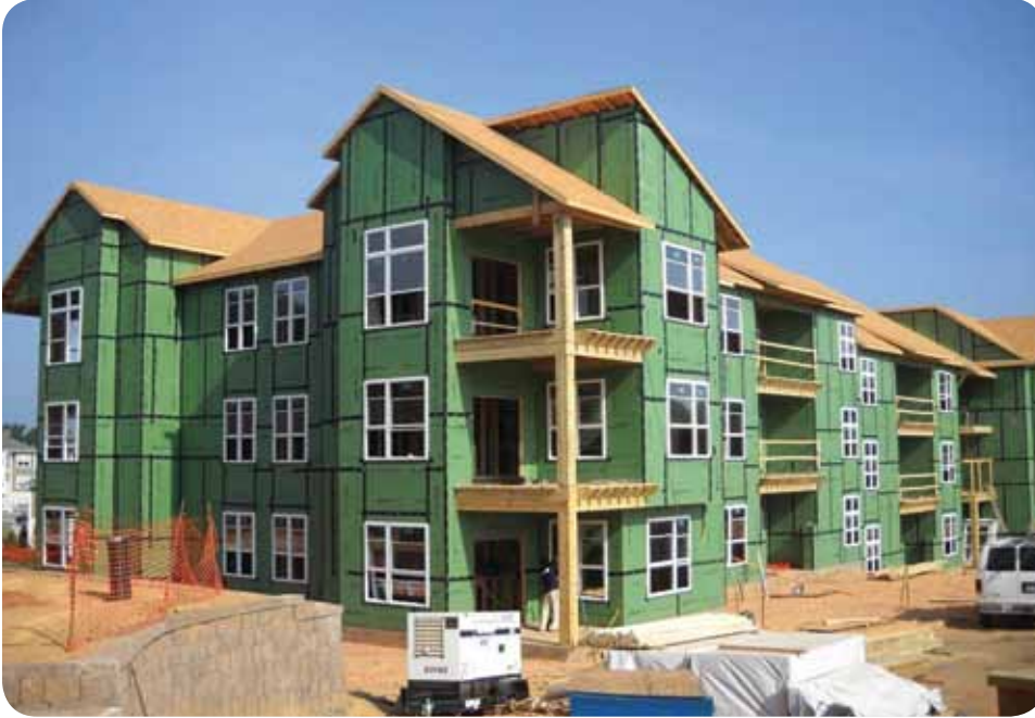
Longview Apartments Charlotte, NC GC: Caroon