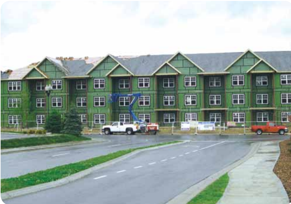
East Tennessee State University Johnson City, TN