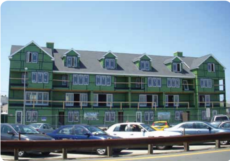
Hampton Condos Hampton Beach, NH