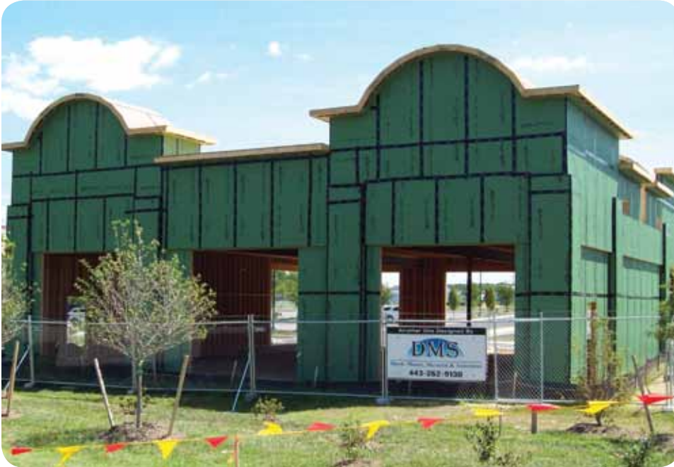
Fast Food Restaurant Maryland