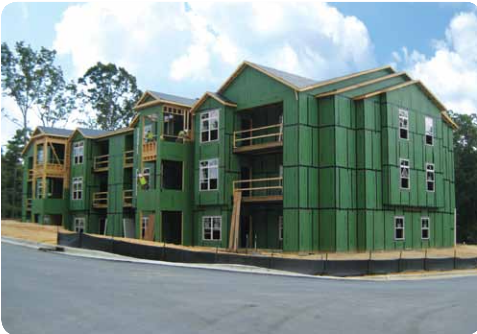
Ashton Reserve at Northlake Mall Charlotte, NC Owner/GC: Sterling Group