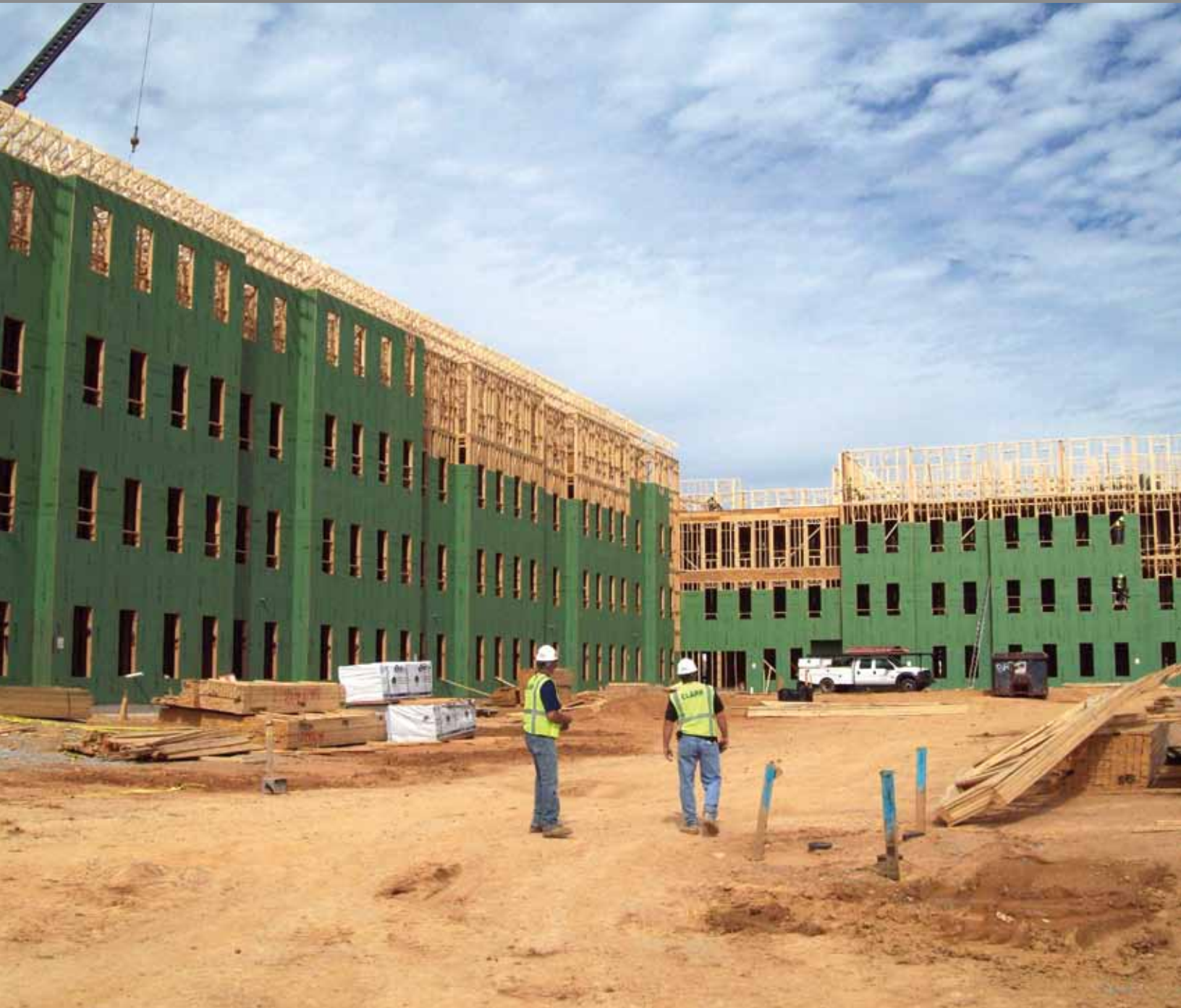
Fort Belvoir Warrior In Transition Housing Alexandria, VA GC: Clark Builders Group