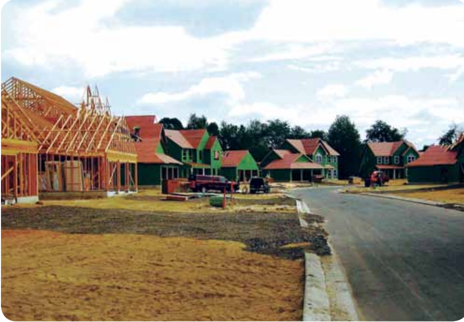
McGuire/Fort Dix Military Family Housing Fort Dix, NJ Architect: Woolpert, Inc. Developer: United Communities