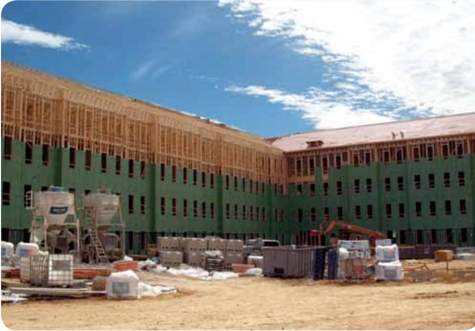
Fort Belvoir Warrior In Transition Housing Alexandria, VA GC: Clark Builders Group