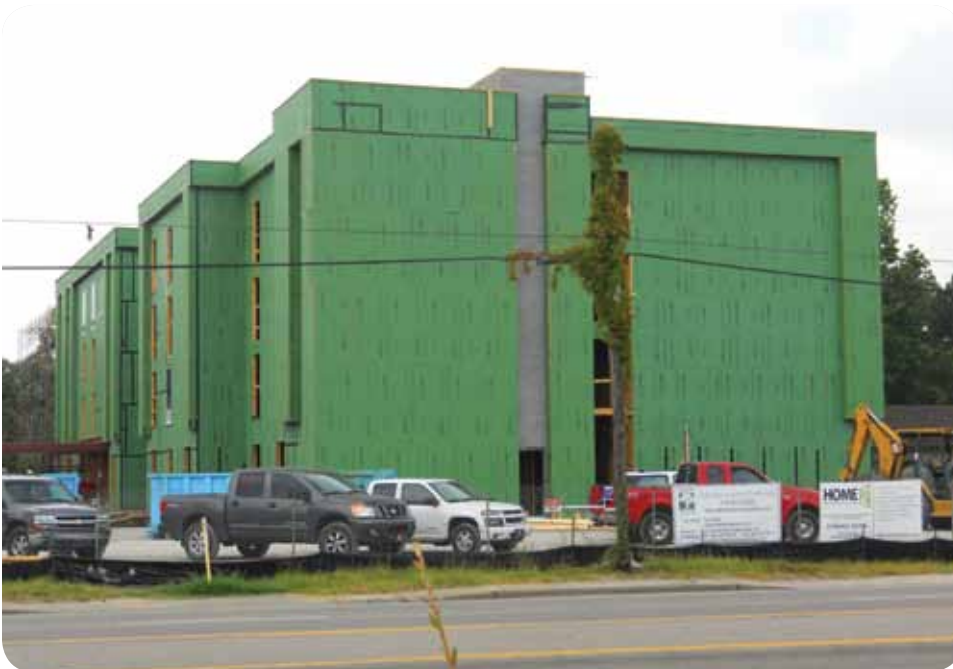
Home 2 Suites Charleston, SC GC: Tri Construction