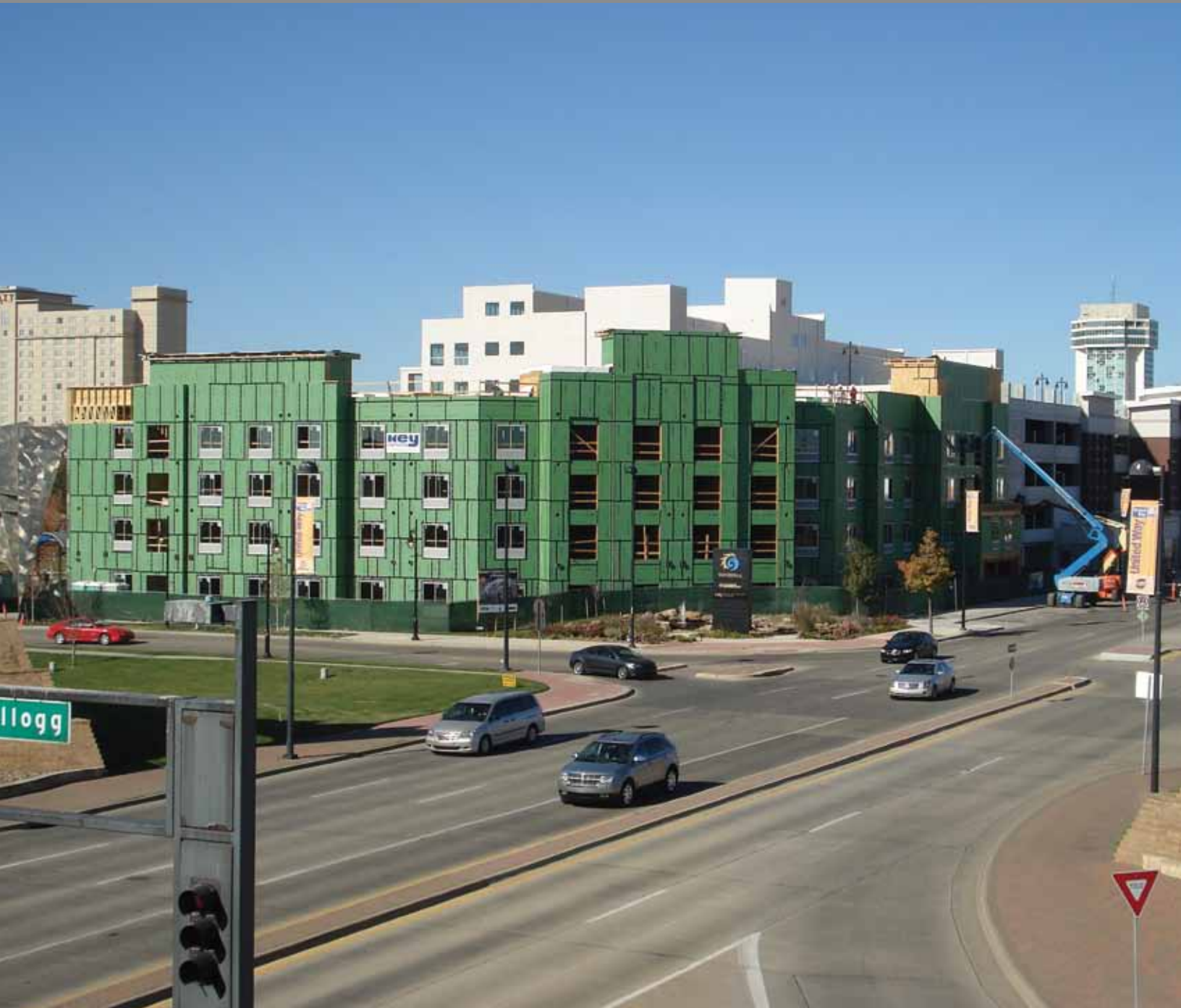
Fairfield Inn by Marriott Wichita, KS Architect: Law Kingdon Architecture GC: Key Construction