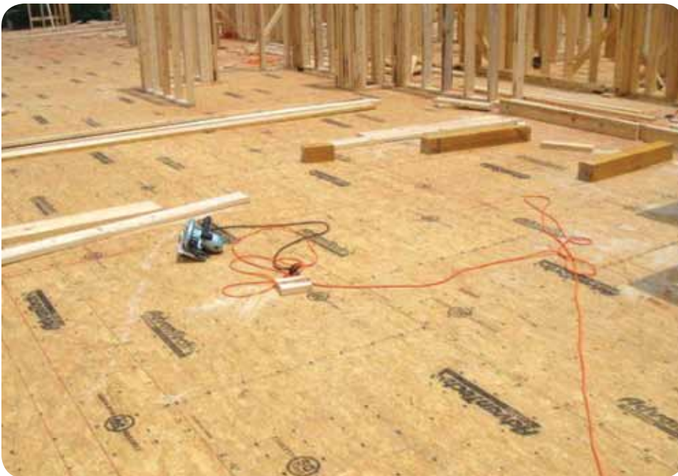
Hotel Dallas, TX