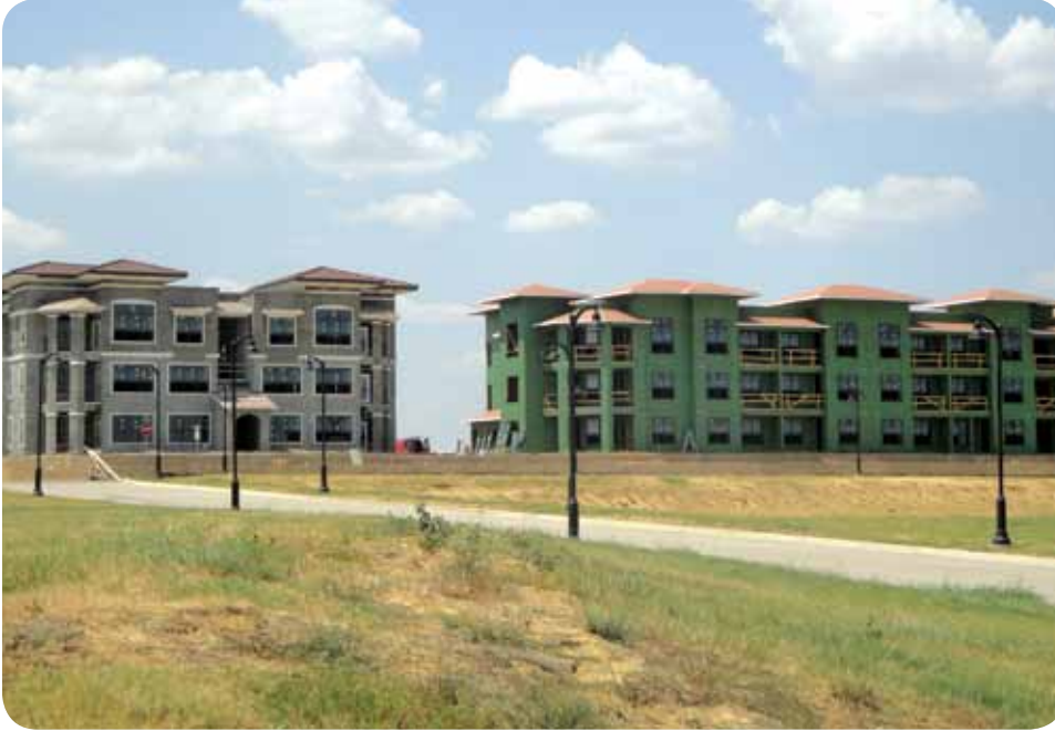
AMLi Escena Dallas, TX Owner: AMLi Framer: Multi Building Incorporated