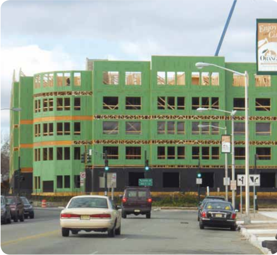
Grand Central Housing New Jersey Architect: Inglese Architects Owner: RPM Development Group