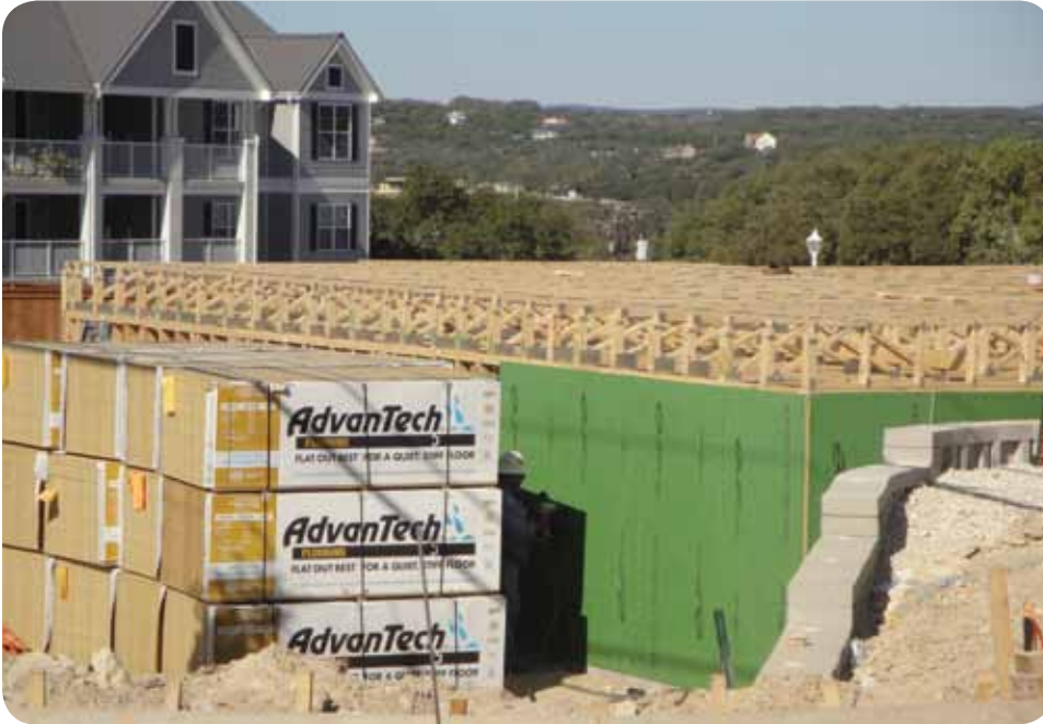
Hill Country Resort by Silverleaf Resorts Canyon Lake, TX