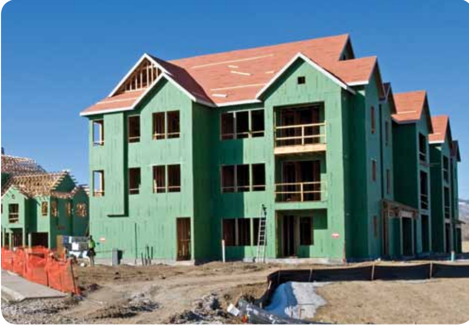
Alta Aspen Grove Denver, CO Architect: Womack & Hampton Architects GC: CSI Construction Framer: AJM